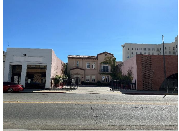
Figure 13. Spanish Colonial Revival Style building at 923 Van Ness Avenue, facing southwest.