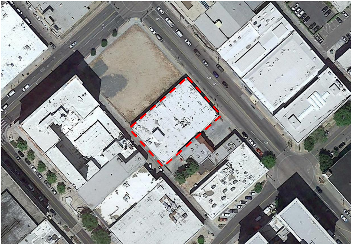
Figure 1. 2021 aerial view of 933 Van Ness Avenue. The approximate border of the subject parcel is outlined in a red dashed line. Source: Google Earth. Edited by Page & Turnbull.

All site exterior photos taken July 27, 2022 by Page & Turnbull unless otherwise noted.