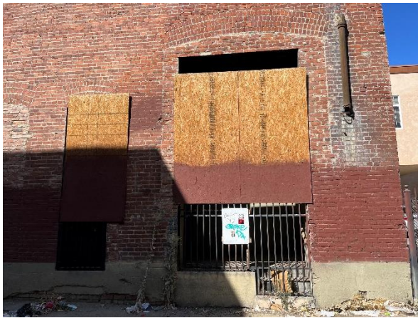
Figure 8. South corner of the southwest (rear) façade, facing northeast. Large, recessed entrance with four course brick arch above (right) and opening with metal grille (right).

The southwest (rear) façade of the building faces the alley (Figure 10). It is flat and with brick facing. There are two recessed entrances with metal gates, concrete steps, and four course brick arches above: one large entrance at the south corner of the façade and one small entrance on the west portion of the façade. An additional large, recessed entrance with metal overhead door is situated in an infill portion on the west portion of the façade (Figure 9). One entrance with a metal grille and two course arch above is located near the south corner of the façade. Four additional openings along the façade, three large and one small, are infilled with brick. Near the west corner of the façade, there are also two smaller basement windows at ground level with brick infill (Figure 10). All openings are at regular intervals with two or four course segmental brick arches above. A plaster base is located along the length of the façade.