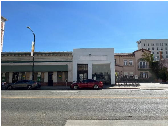
Figure 14. Building at 915 Van Ness Avenue, facing southwest.