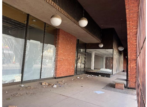
Figure 3. Arcade with globe lights and steel-framed storefront windows with dentil cornice and metal grille above at primary entrances on northeast façade, facing northwest.