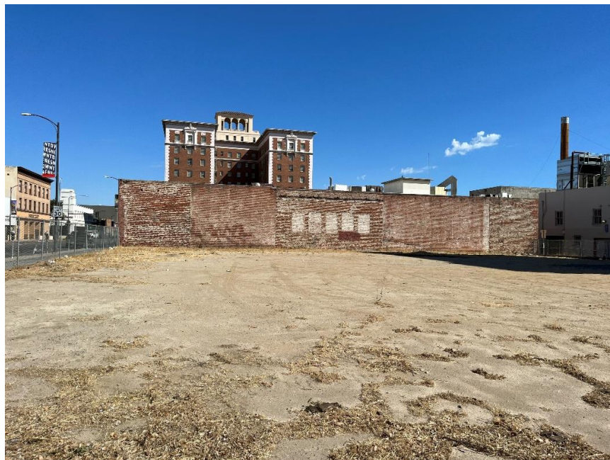
Figure 11. Northwest façade, facing southeast.

The northwest façade of 933 Van Ness Avenue adjoins the vacant property to the northwest ( Figure 11 ). The façade is flat with brick facing in varying conditions. Infill is visible along the façade, most notably five previous openings on the north portion.