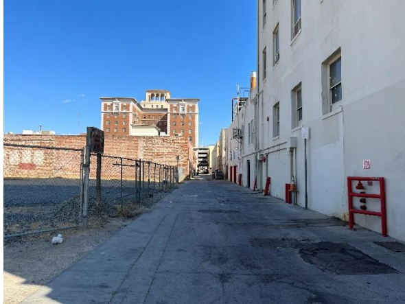
Figure 12. Vacant lot adjoining 933 Van Ness Avenue (left) and rear alleyway, facing southeast.

The building at 933 Van Ness Avenue occupies the entire parcel. A vacant lot adjoins the subject property to the northwest ( Figure 12 ). To the southwest of the property, located at 923 Van Ness Avenue, is a small, Spanish Colonial Revival style commercial building with a significant setback from Van Ness Avenue ( Figure 13 ). The surrounding site context generally consists of low- to mid-rise commercial buildings ( Figures 14 and 15 ).