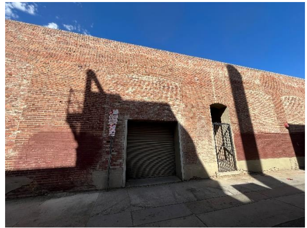
Figure 9. West portion of the rear façade, facing east. Small, recessed entrance with metal gate (right) and large, recessed entrance with metal overhead door (left).