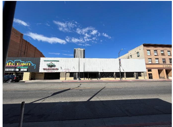
Figure 15. Building at 930-932 Van Ness Avenue, facing northeast.

The building at 933 Van Ness Avenue is the adapted and redesigned first story of the four-story 1912 Sequoia Hotel Building, which was partially demolished in 1962 with the first story retained and redesigned as a four-unit commercial building. Permit and historical image research did not reveal any major alterations to the 1962 commercial building since it was surveyed in 2011. 1