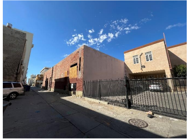
Figure 7. South portion of the southeast façade, facing north.

The southwest (rear) façade of the building faces the alley (Figure 10). It is flat and with brick facing. There are two recessed entrances with metal gates, concrete steps, and four course brick arches above: one large entrance at the south corner of the façade and one small entrance on the west portion of the façade. An additional large, recessed entrance with metal overhead door is situated in an infill portion on the west portion of the façade (Figure 9). One entrance with a metal grille and two course arch above is located near the south corner of the façade. Four additional openings along the façade, three large and one small, are infilled with brick. Near the west corner of the façade, there are also two smaller basement windows at ground level with brick infill (Figure 10). All openings are at regular intervals with two or four course segmental brick arches above. A plaster base is located along the length of the façade.