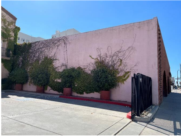
Figure 6. Northeast portion of the southeast façade, facing west.

The southeast façade adjoins the commercial property at 923 Van Ness Avenue. The façade is plaster-coated with no openings (Figure 6 and Figure 7).