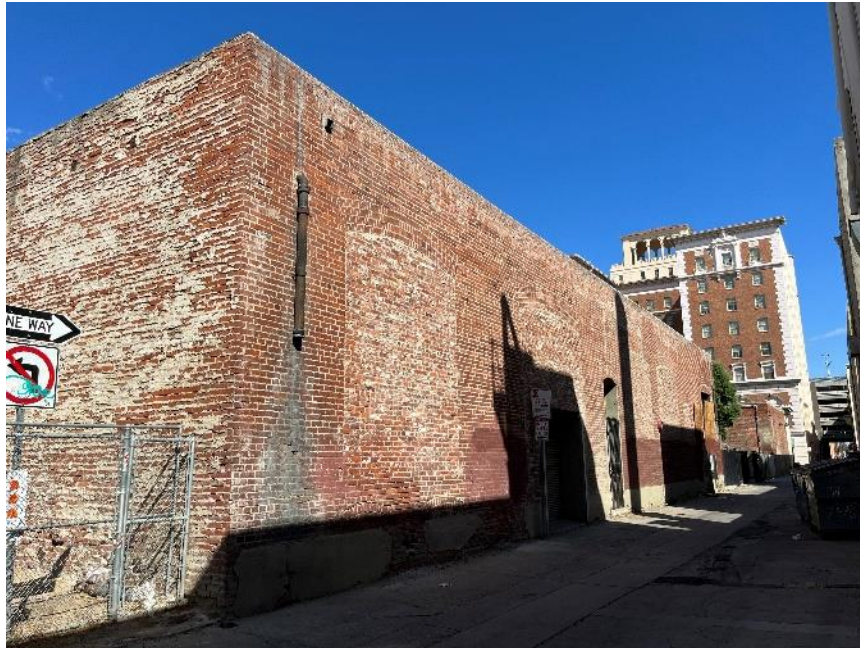
Figure 10. West corner of the rear façade, facing east. Infill visible, including two smaller basement windows at ground level with brick infill.

Resource Name or # 933 Van Ness Avenue *Date July 27, 2022 Continuation Update