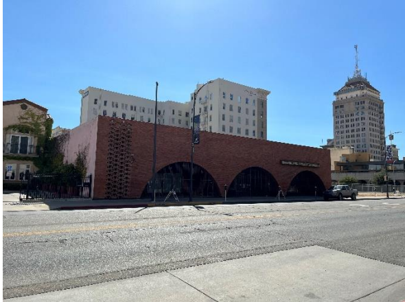
Figure 2. Northeast (primary) façade, facing west.

The primary (northeast) façade is flat with brick facing of various courses. It features three oversized, low-arched entrances located toward the north portion of the façade, opening into an arcade with concrete and brick benches, globe lights for illumination and steel-framed storefront windows with dentil cornice and metal grille above (Figure 2 and Figure 3). A pop-out storefront volume is located at the northern portion of the arcade (see Figure 3). The arcade is enclosed at the entrances by full-height metal gates (Figure 4). A decorative, full-height vented brick screen is located near the southeast corner of the façade (Figure 5).