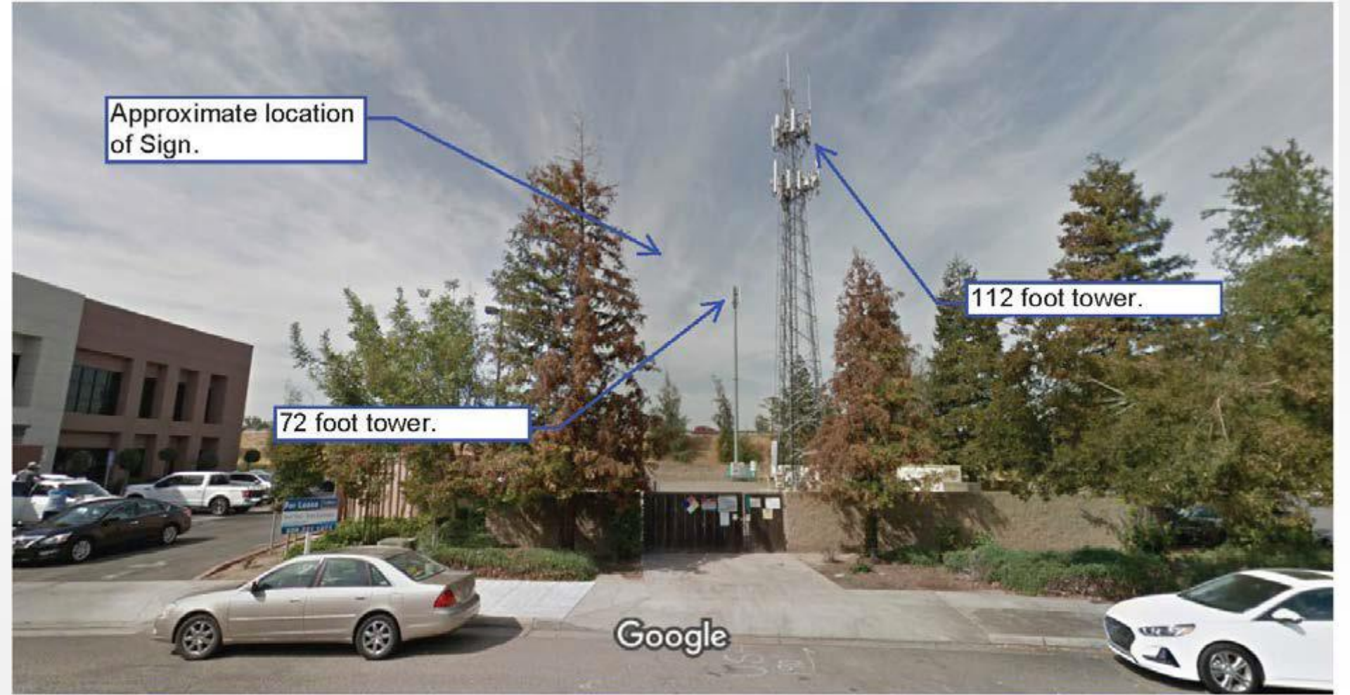
Ground level view of the Property.