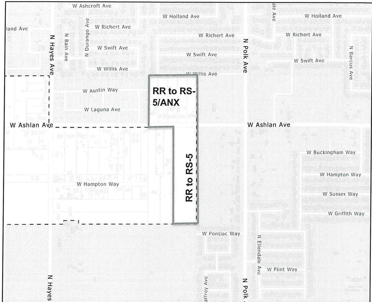
Exhibit A – Vicinity Map