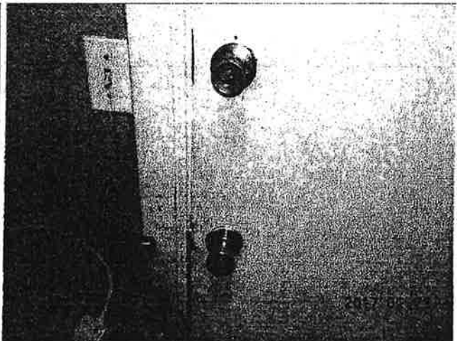
Date: 2/22/2017 8:20:46 AM REAR DOOR DOES NOT OPEN AND CLOSE PROPERLY. BINDS AND STICKS