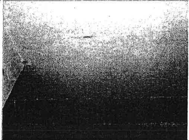
Date: 2/22/2017 8:18:19 AM CEILING REPAIR AT HALLWAY WATER STAINED.