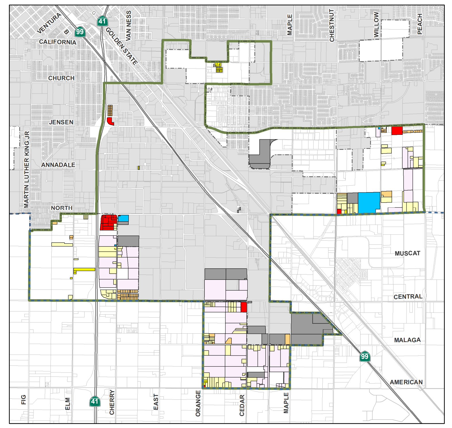
FIGURE 4-7: ADOPTED GENERAL PLAN PARCELS CHANGING BY THE SPECIFIC PLAN LAND USE