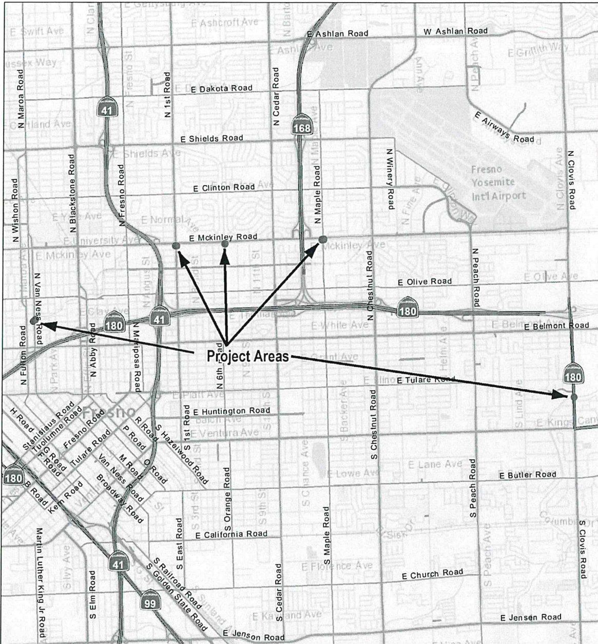
5060(328) City of Fresno - Bridge Preventive Maintenance Program Phase 2