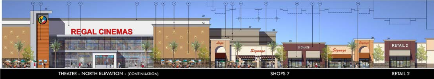
THEATER - NORTH ELEVATION - (CONTINUATION)