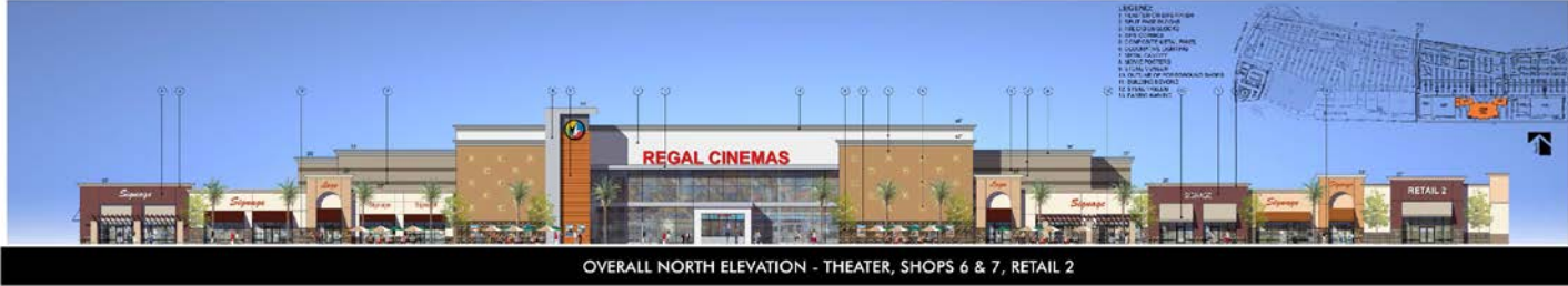
OVERALL NORTH ELEVATION - THEATER, SHOPS 6 & 7, RETAIL 2