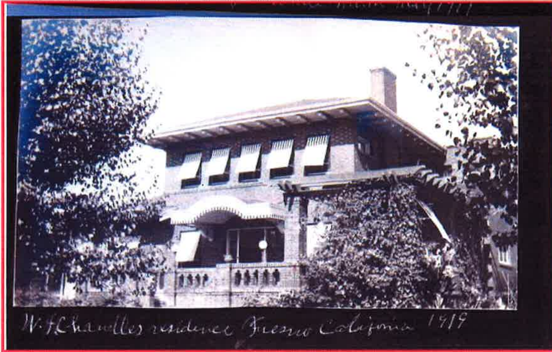
Historic Photo 1919; south elevation of Chandler Home (September 2016)