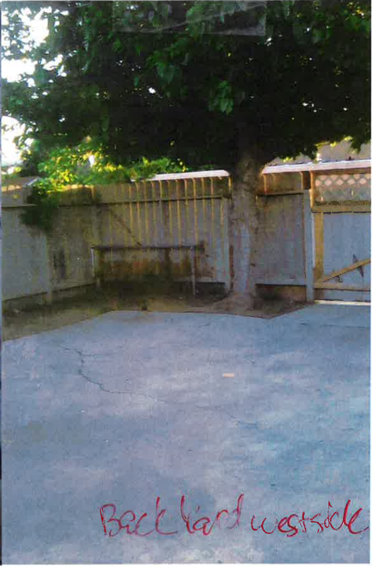
Back yard westside