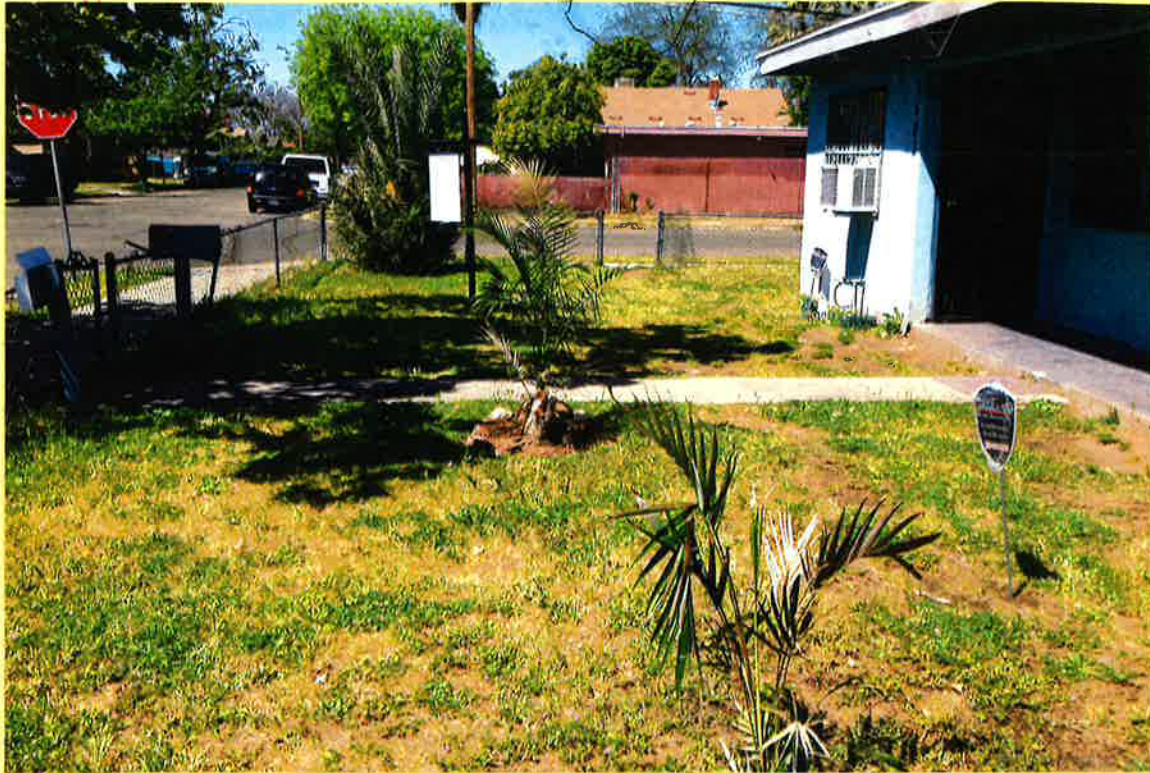
Front yard. Now