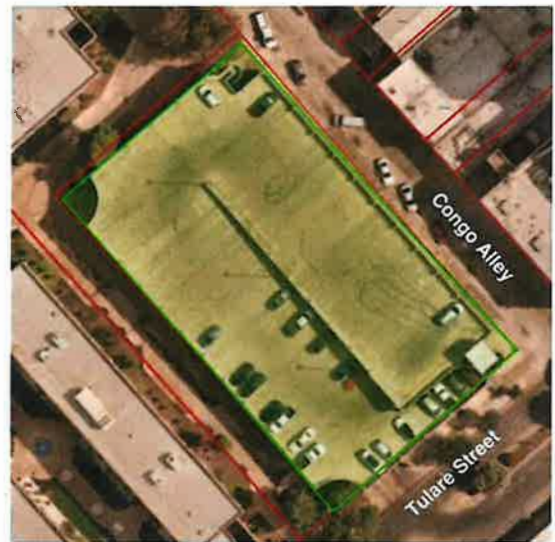
Figure 5: Congo Alley Garage