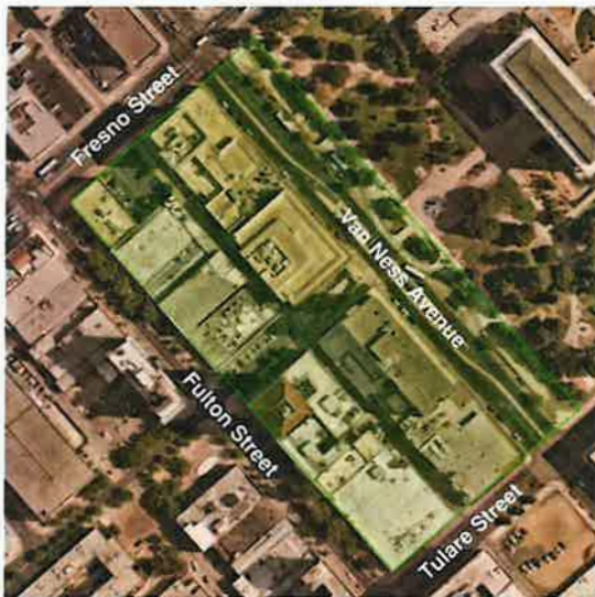
Figure 4: Underground Garage