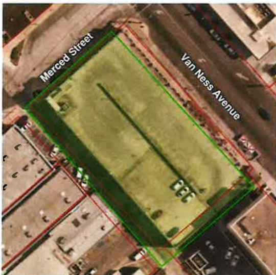
Figure 6: Merced Garage