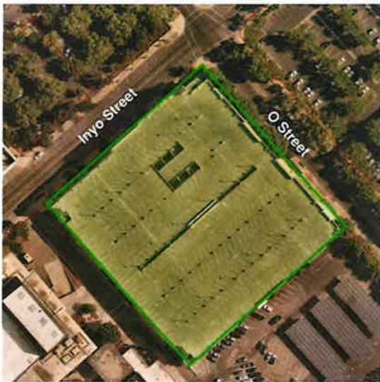
Figure 2: Convention Center Garage