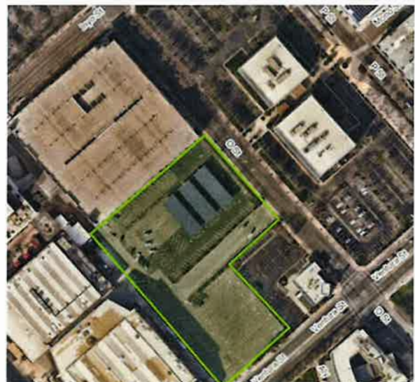
Figure 7: Convention Center Surface Lot