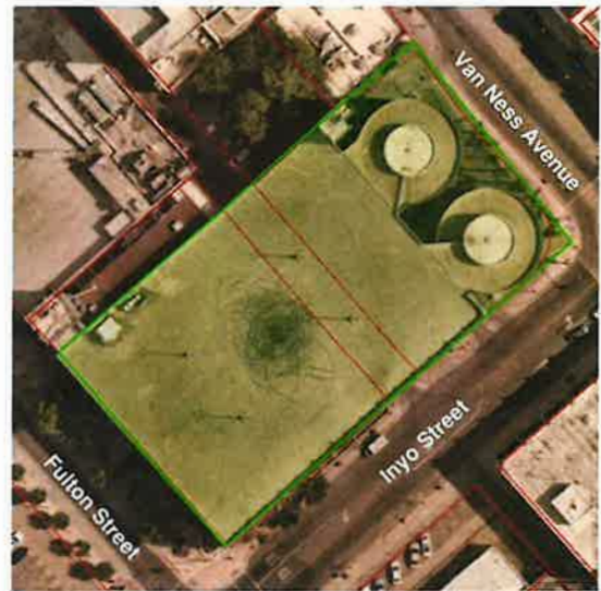
Figure 3: Spiral Garage