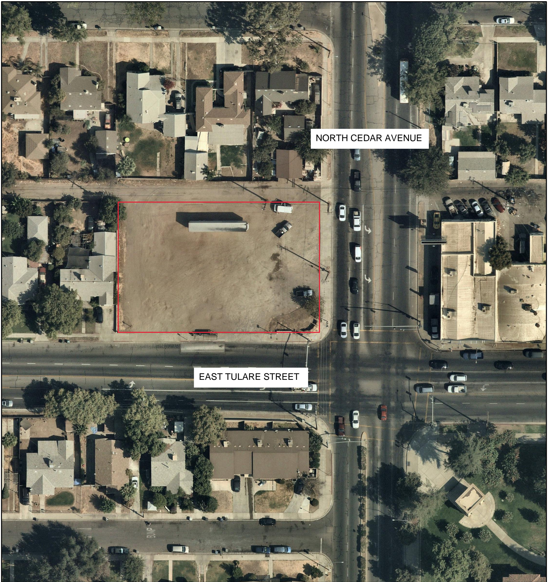
Exhibit A - Aerial Photograph