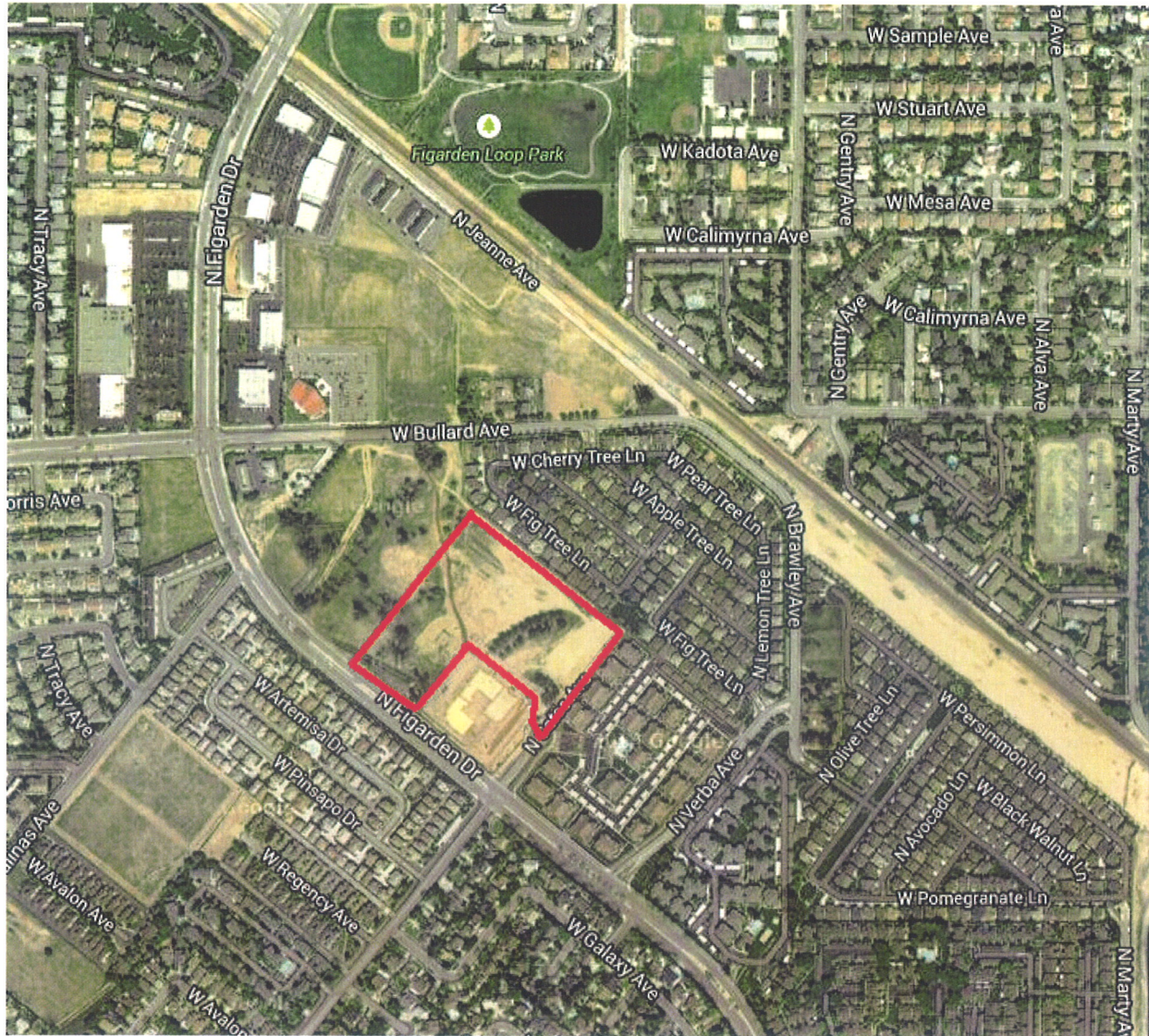
AERIAL PHOTO 2013