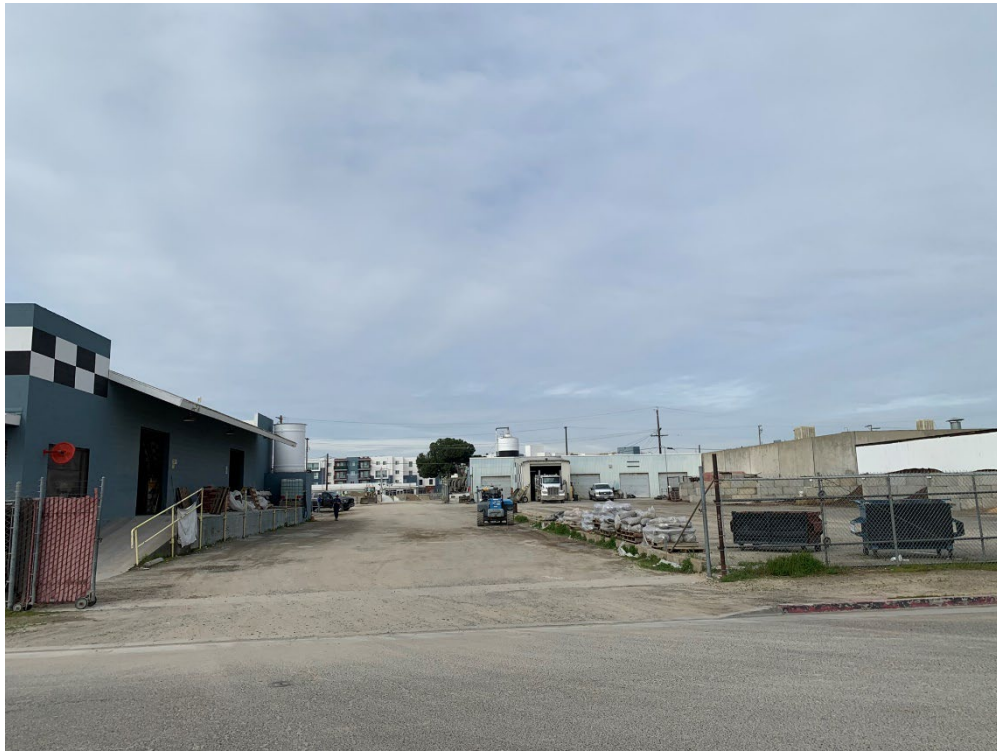
OVERALL SUBJECT PROPERTY