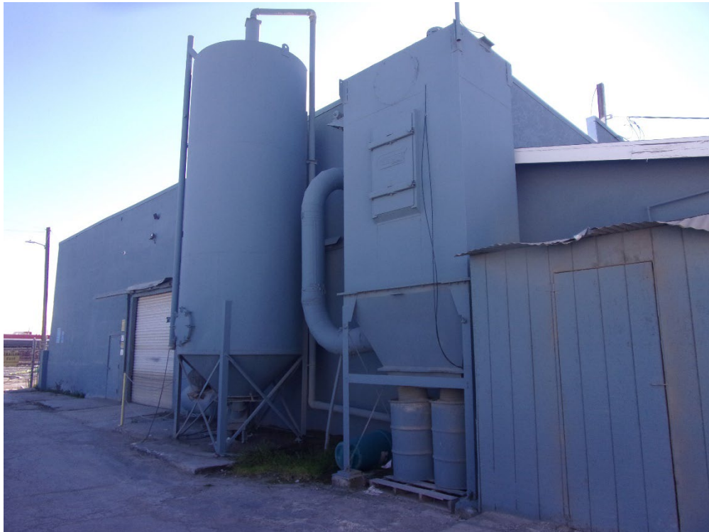
SILO & DUST COLLECTOR