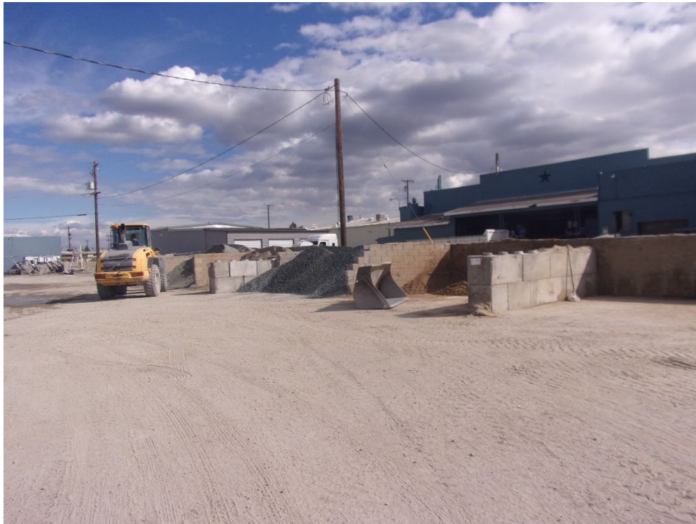
MATERIAL SCALE HOPPER & CONVEYOR