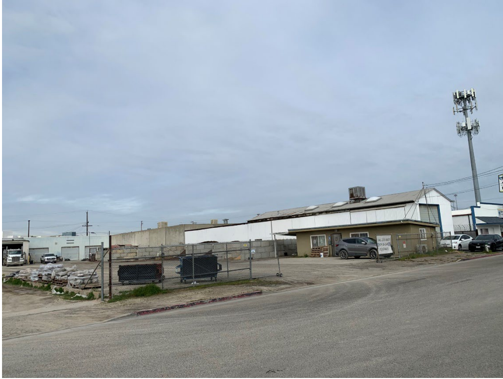
ENTRANCE FROM N. EFFIE