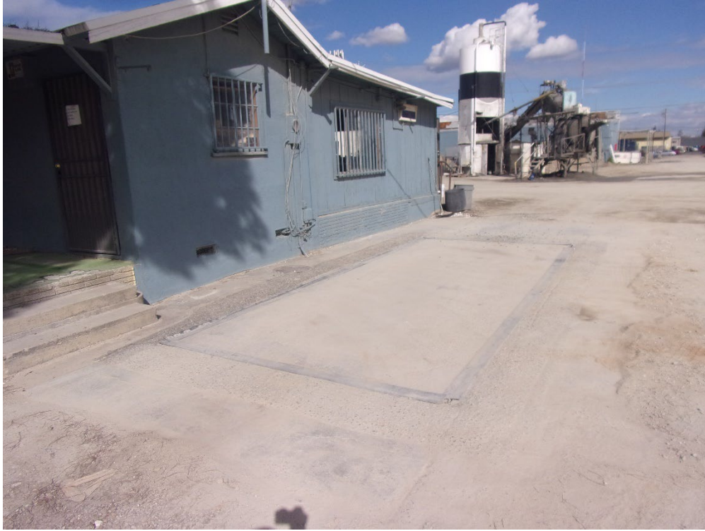
IN-GROUND TRUCK SCALE