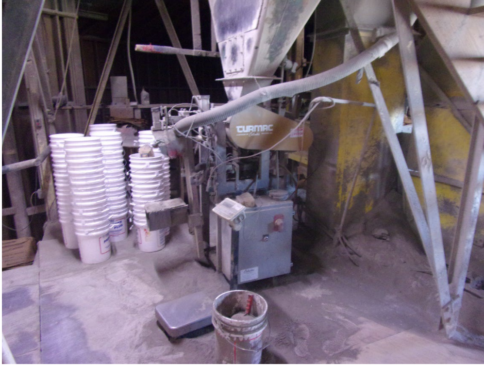
STUCCO BAGGER MACHINE