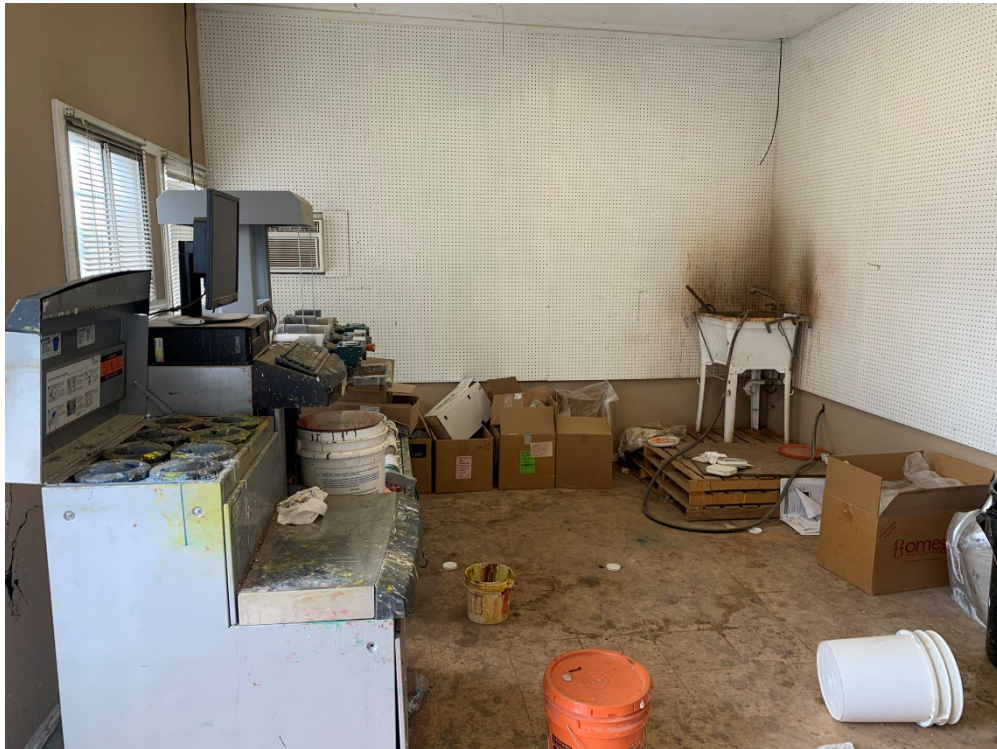
ACRYLIC/PAINT ROOM EQUIPMENT