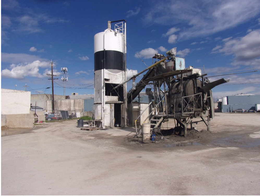
CONCRETE BATCH PLANT