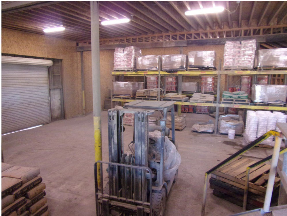
STUCCO MANUFACTURING WAREHOUSE