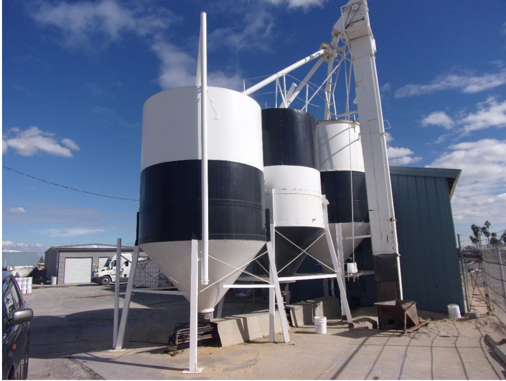
STUCCO-SAND SILOS & BUCKET ELEVATOR