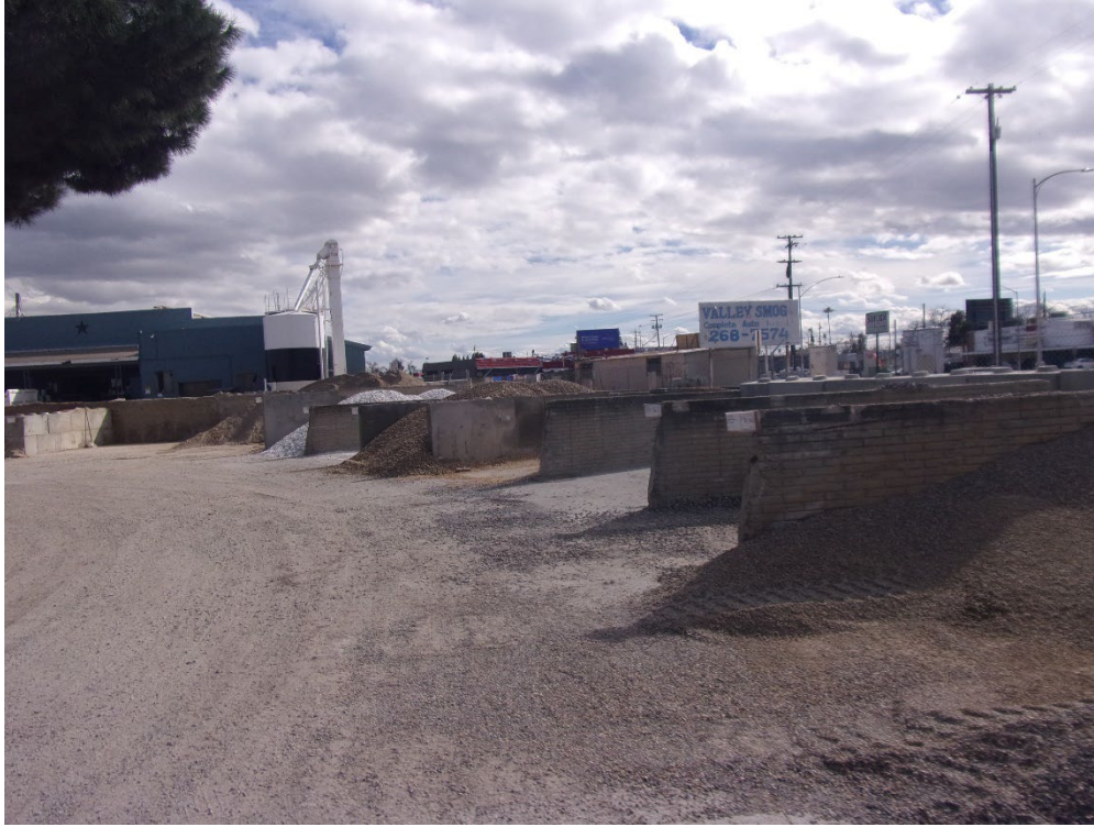
MATERIAL BUNKERS & CONCRETE HARDSCAPE