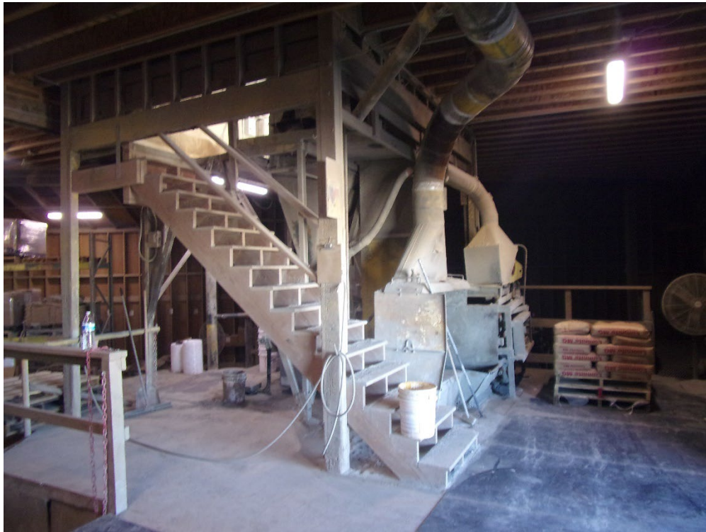
STUCCO MANUFACTURING PLATFORM & EQUIPMENT