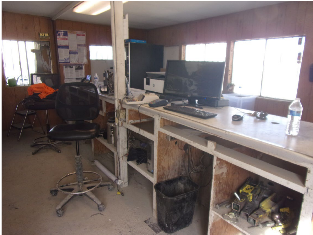
FRONT OFFICE INTERIOR