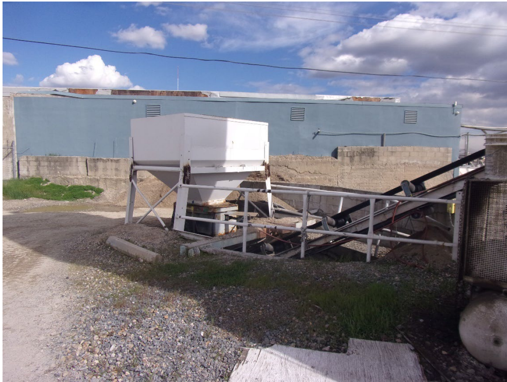
MATERIAL SCALE HOPPER & CONVEYOR