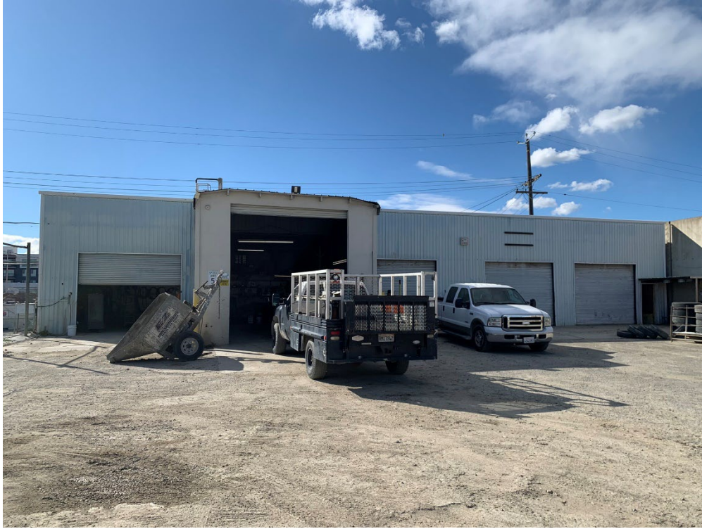
MAINTENANCE SHOP EXTERIOR