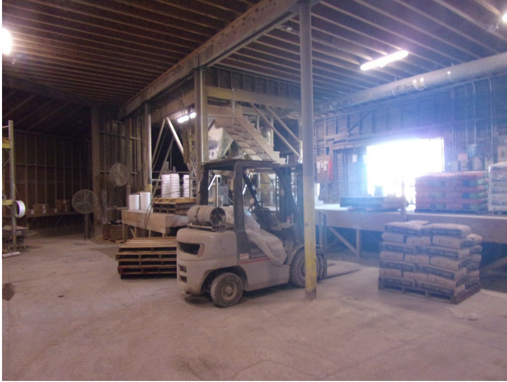
STUCCO PLANT OVERALL