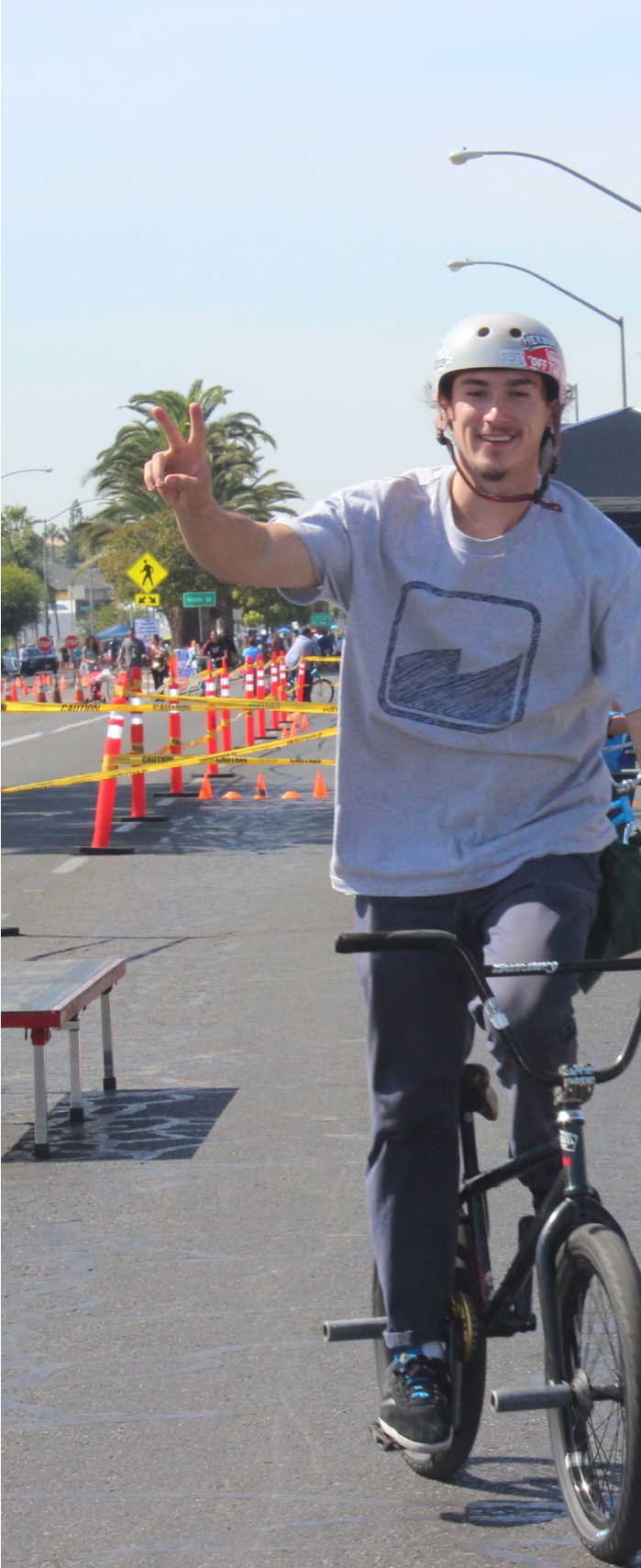
Bicyclist at CenCalVia on King Canyon