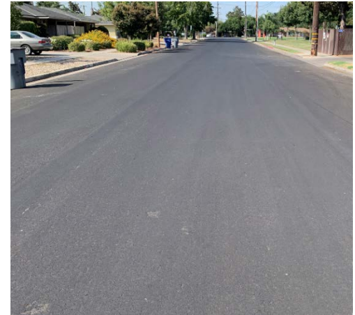
El Dorado Neighborhood