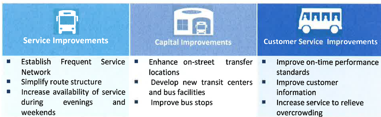
Table 2: Preferred Network Plan

operational and capital improvements that work together to improve efficiencies and customer service with minimal investment (Table 2).