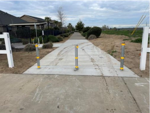
Trail connection – Riverside area (before).....(and after)