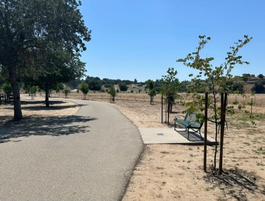
64 new trees planted