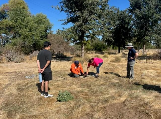
Native Garden Irrigation Restoration