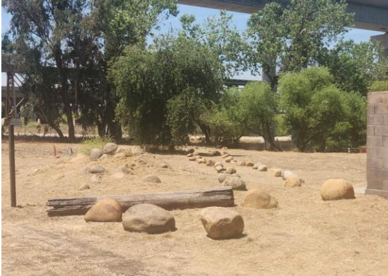
Camp Pashayan work now underway to address deferred maintenance