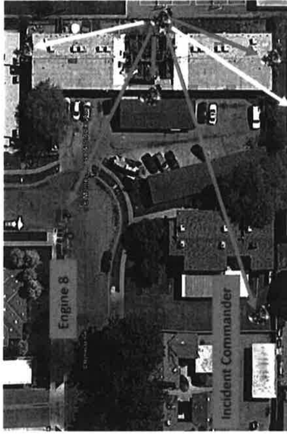
Without Vote Scan