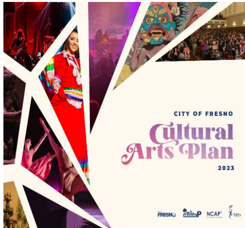
Figure 1 - A photo of the Cultural Arts Plan

Measure P (Sec. 7-1506(b)(4)(C)) requires that prior to the implementation of the Expanded Access to Arts and Culture Grant Program, the Commission shall work in partnership with the Fresno Arts Council, and local arts and cultural stakeholders, to develop a Cultural Arts Plan for the City of Fresno that identifies needs in the arts and cultural community; prioritizes outcomes and investments; and develops a vision and goals for the future of Fresno arts and cultural programs that are reflective of the cultural, demographic, and geographic diversity of Fresno. The Cultural Arts Plan must be updated every five years.