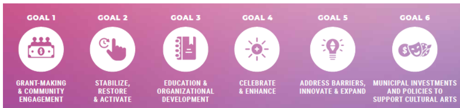
Figure 2 - A graphic which highlights the six (6) overarching goals outlined in the Cultural Arts Plan.

To realize the vision of the Cultural Arts Plan , six (6) goals were outlined. Each goal includes a set of recommendations and strategies for implementation. Grant applicants must indicate which of the Cultural Arts Plan recommendations and/or strategies will be implemented to support achievement of the Cultural Arts Plan goals and desired outcomes. Based on the nature of the recommendations and strategies included in the Cultural Arts Plan , grant proposals are generally expected to implement recommendations and strategies that achieve Goals Two (2) through Five (5).