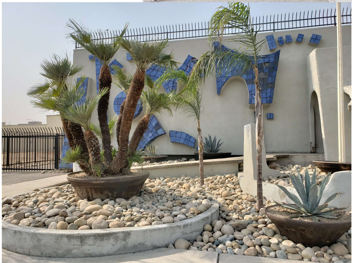
Landscape features 27 October 2019; Bitters plaque and entrance