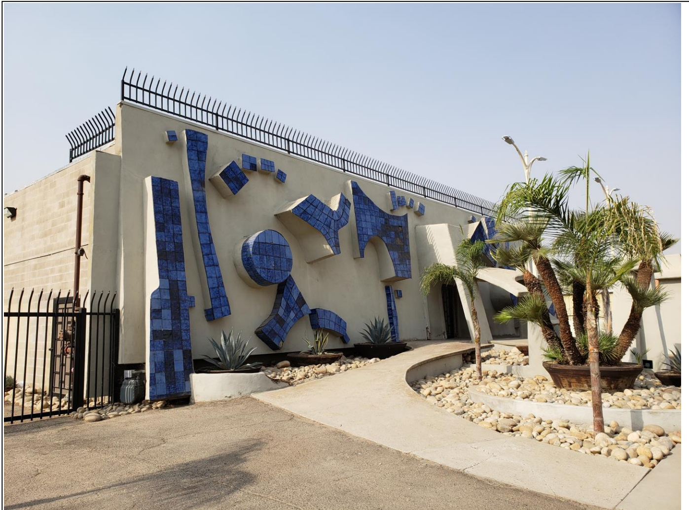
Looking northwest, 27 October 2019