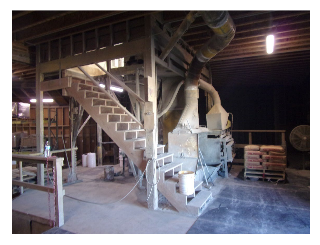
STUCCO MANUFACTURING PLATFORM & EQUIPMENT