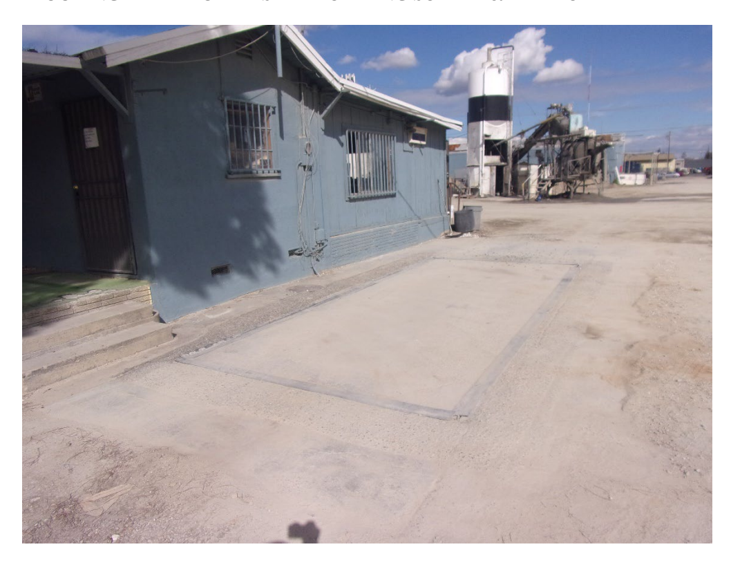
IN-GROUND TRUCK SCALE