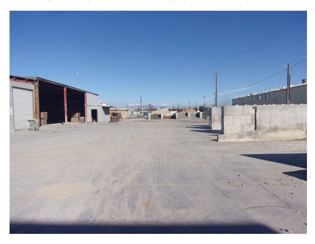
REMAINDER BUNKER STORAGE & CONCRETE HARDSCAPE