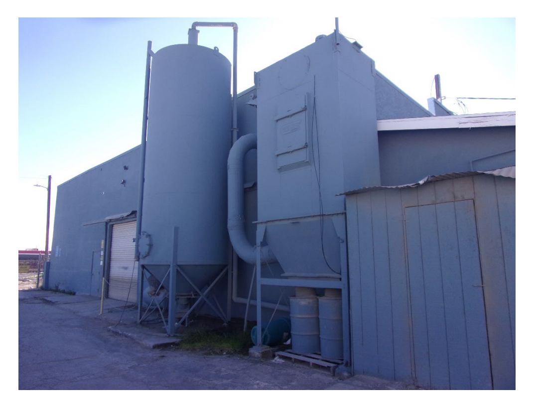
SILO & DUST COLLECTOR