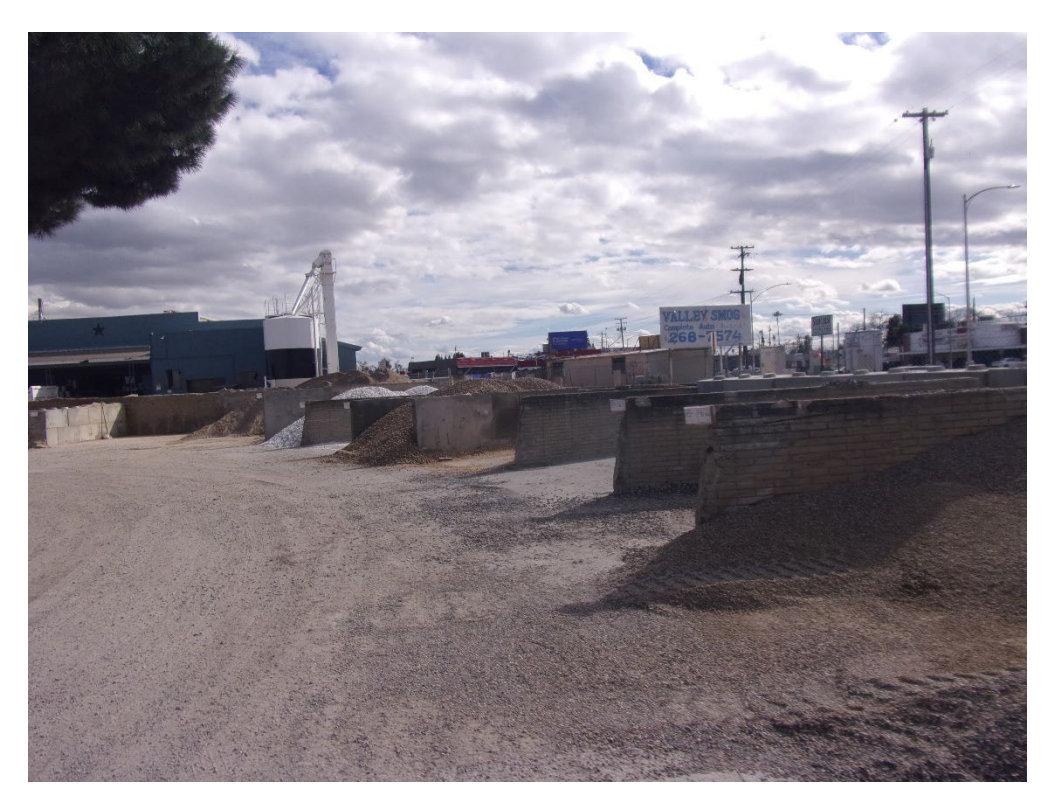
MATERIAL BUNKERS & CONCRETE HARDSCAPE