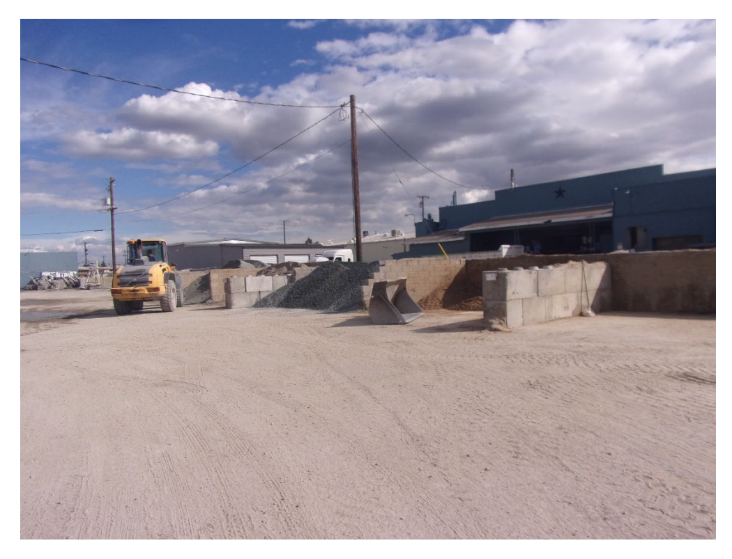
MATERIAL SCALE HOPPER & CONVEYOR