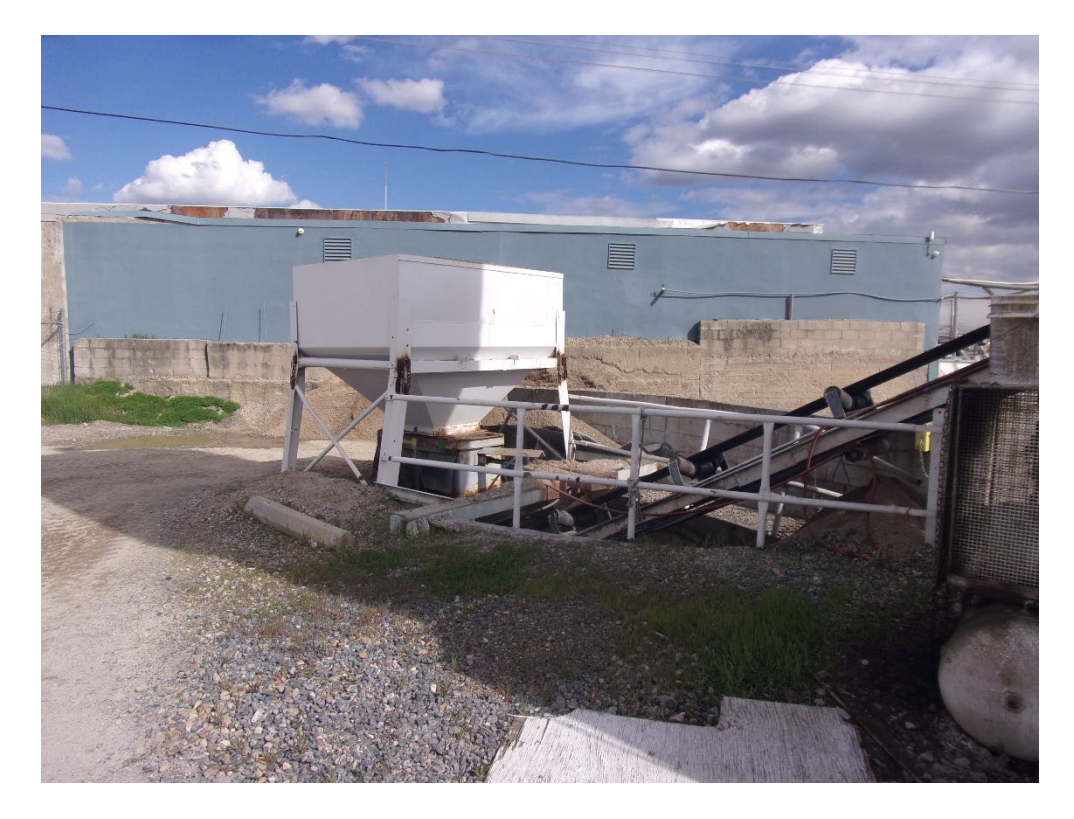
MATERIAL SCALE HOPPER & CONVEYOR