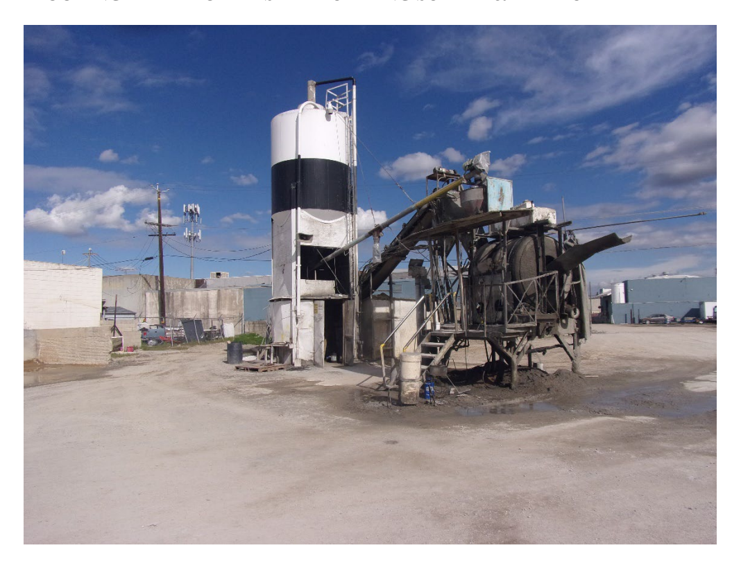
CONCRETE BATCH PLANT