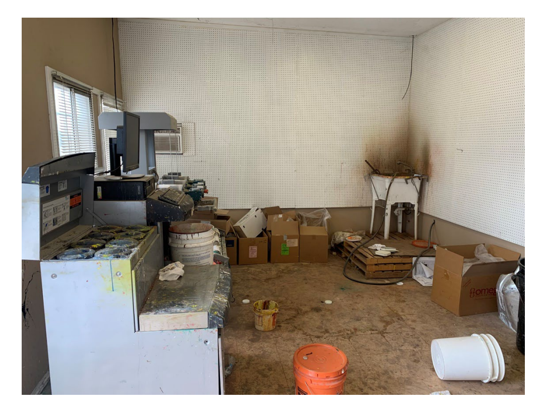
ACRYLIC/PAINT ROOM EQUIPMENT