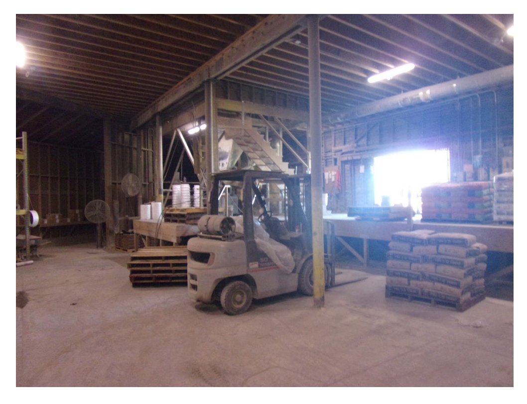
STUCCO PLANT OVERALL