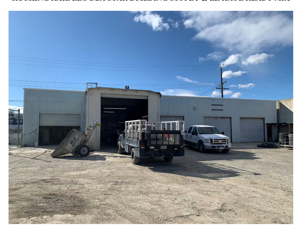
MAINTENANCE SHOP EXTERIOR