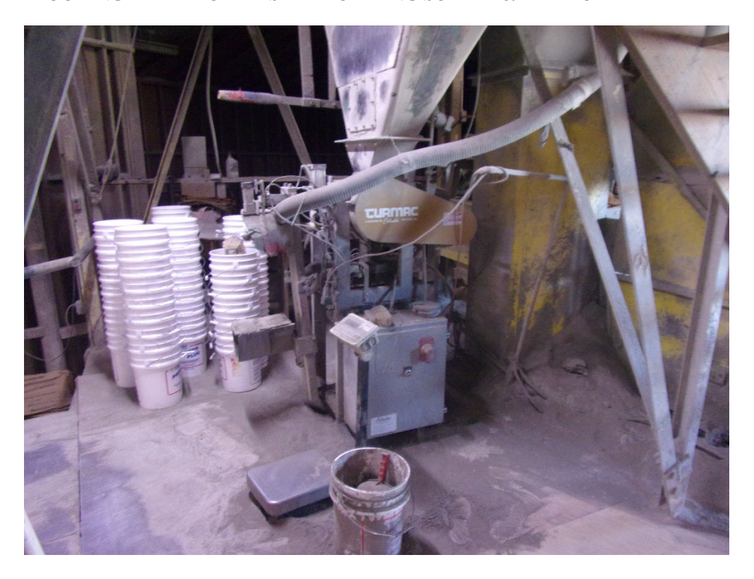
STUCCO BAGGER MACHINE