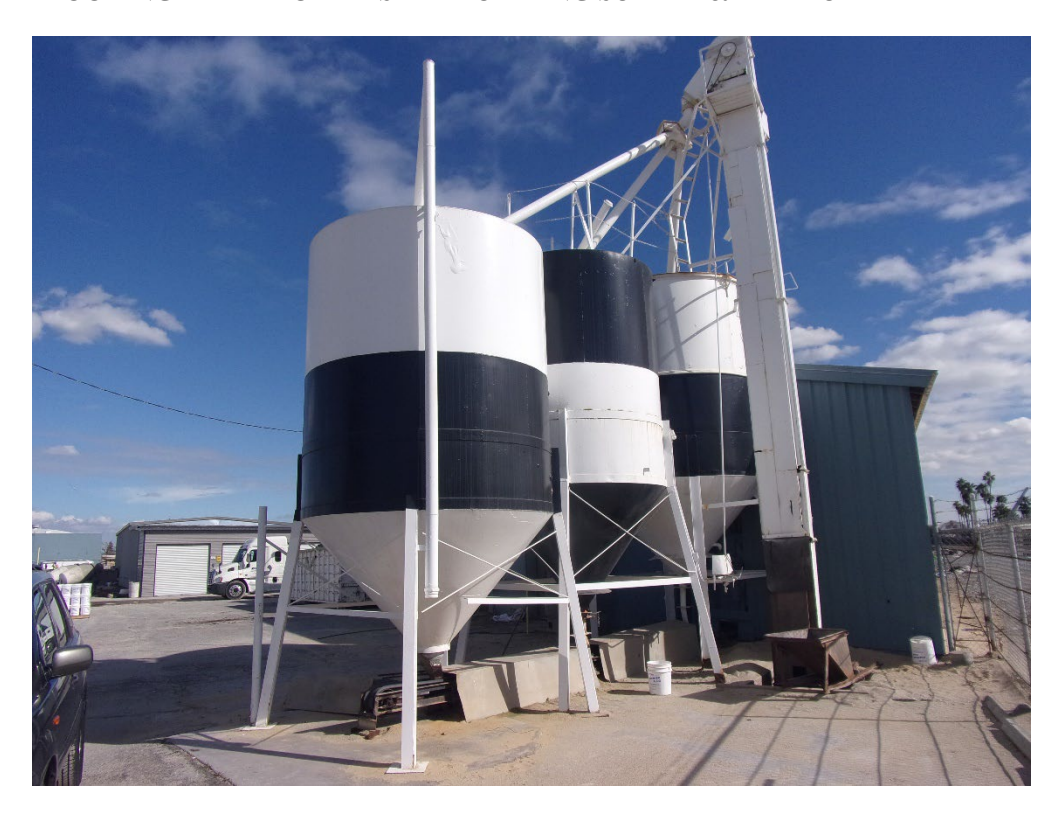
STUCCO-SAND SILOS & BUCKET ELEVATOR