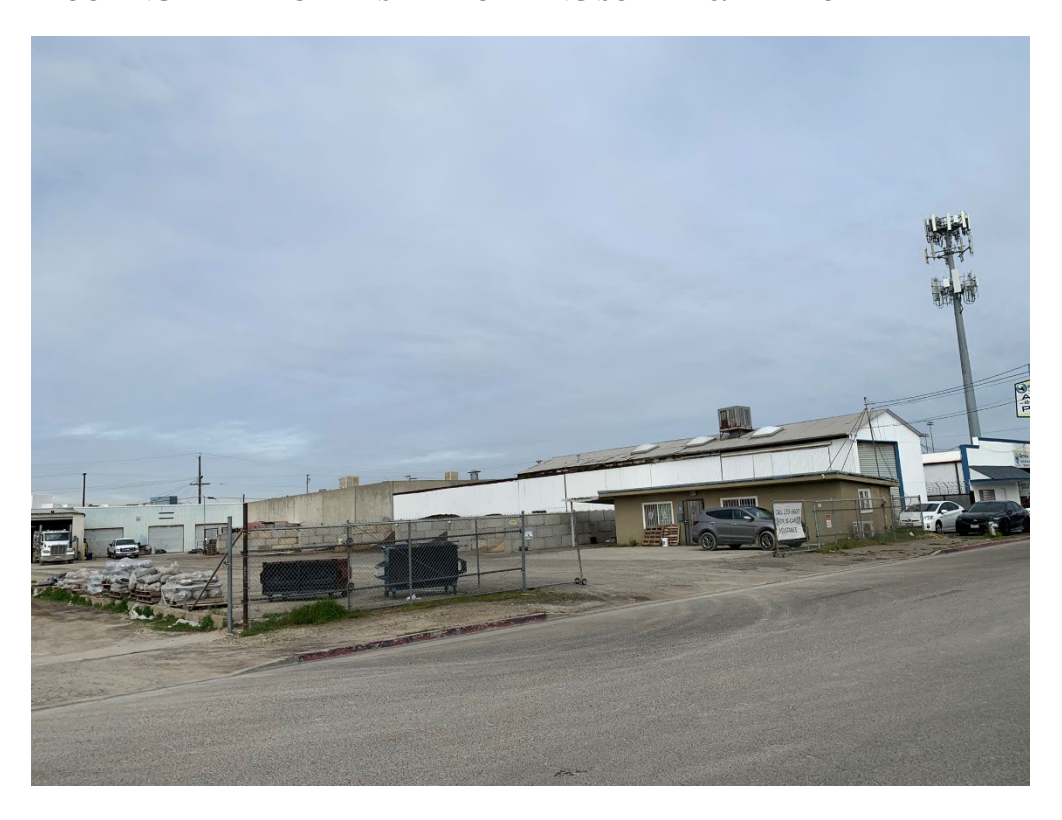
ENTRANCE FROM N. EFFIE