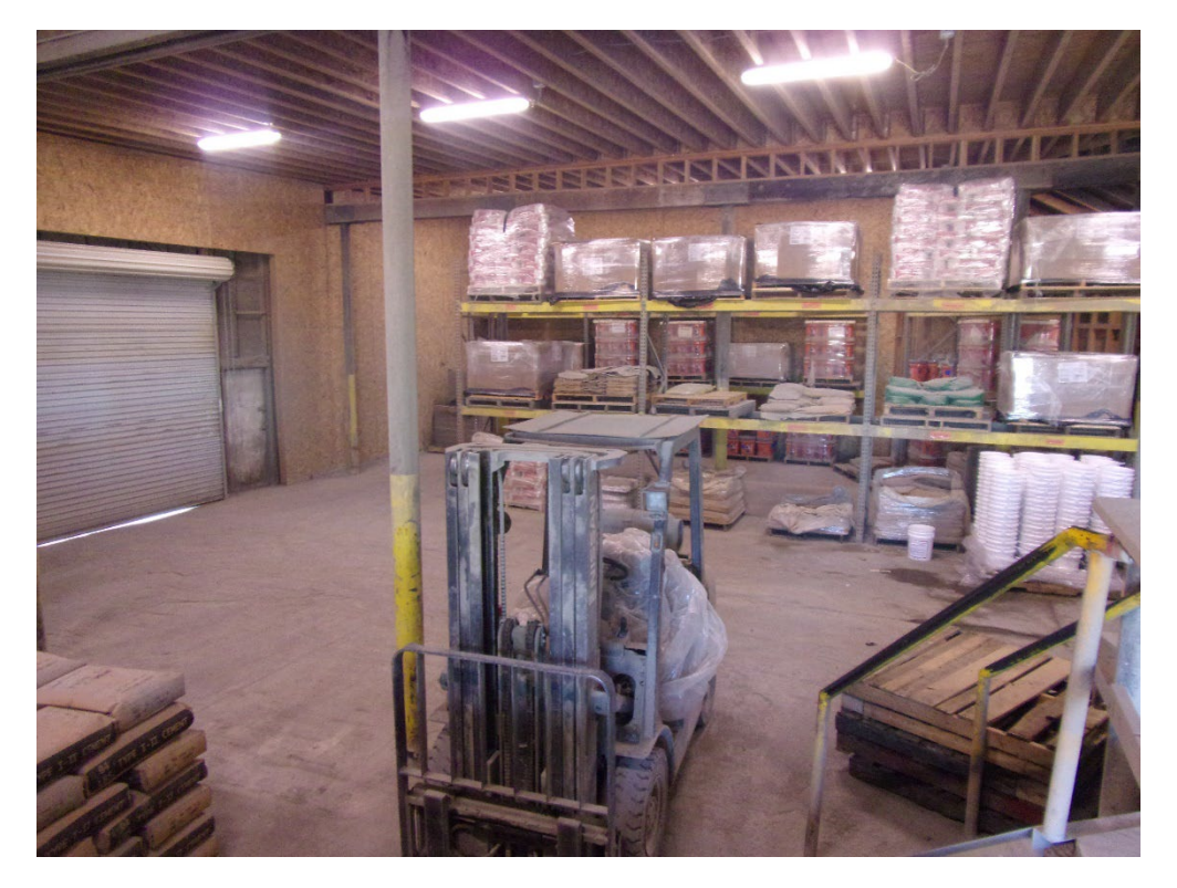
STUCCO MANUFACTURING WAREHOUSE