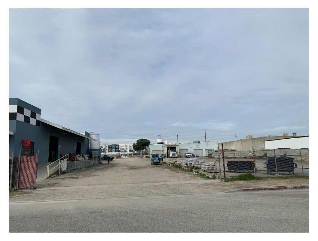
OVERALL SUBJECT PROPERTY