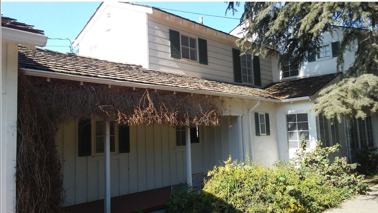
Rear elevation with sleeping porch; south end of facade with tack room.