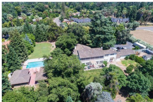
Aerial looking east

Regardless of whether Charles Butner was the architect of record for the Hays Home or not, the complex is eligible for listing on Fresno's Local Register of Historic Resources and probably on the National Register of Historic Places. The property is more than fifty years of age and possesses integrity of location, design, setting, materials, workmanship, feeling and association (FMC12-1607). Additionally It is significant under Local Register Criterion i as an early important suburban ranch property in the development of the Sunnyside neighborhood; it is associated with a family of importance to the community, specifically Ray Hays who served as a State Senator from 1930-1942; and it has architectural distinction as a rambling country estate and complex with multiple design influences prominent in Fresno, and the country, between the two World Wars (Criterion iii).