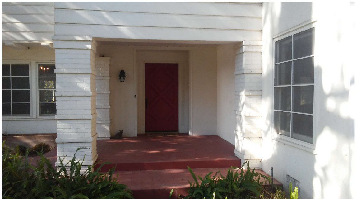
Swimming pool complex and front entrance with brick piers