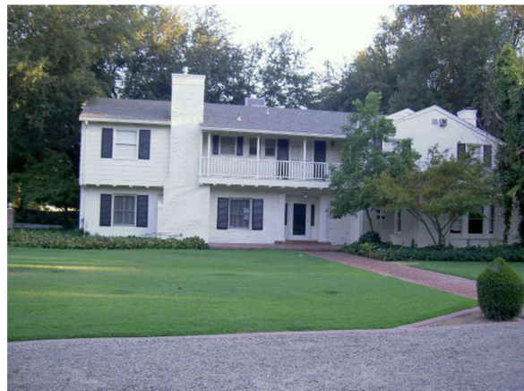
5424 E. Butner