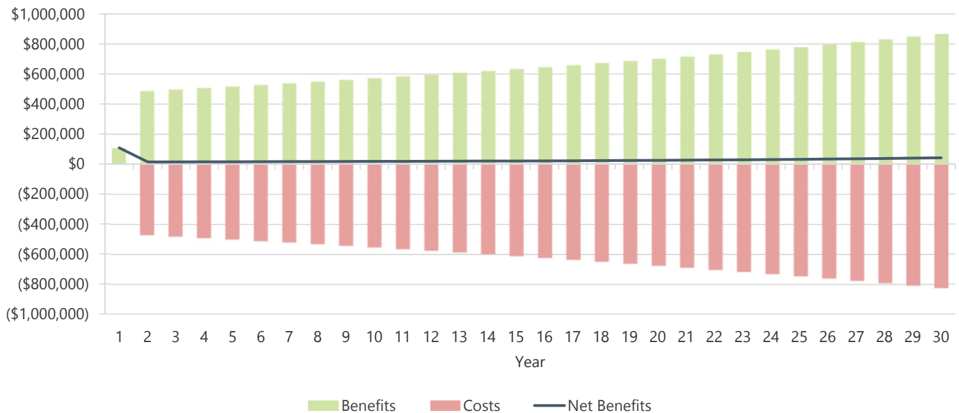
Figure 2. Annual Fiscal Net Benefits for the City of Fresno