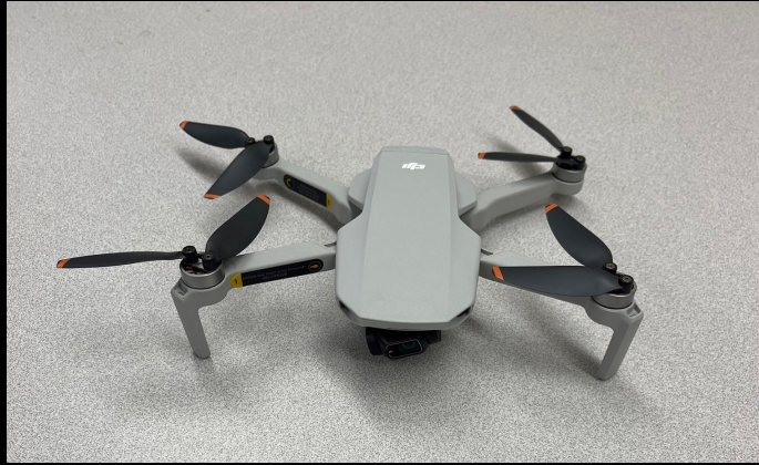
DJI MAVIC MINI