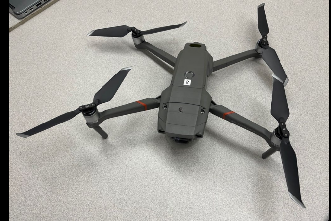
DJI ENTERPRISE/ ADVANCED