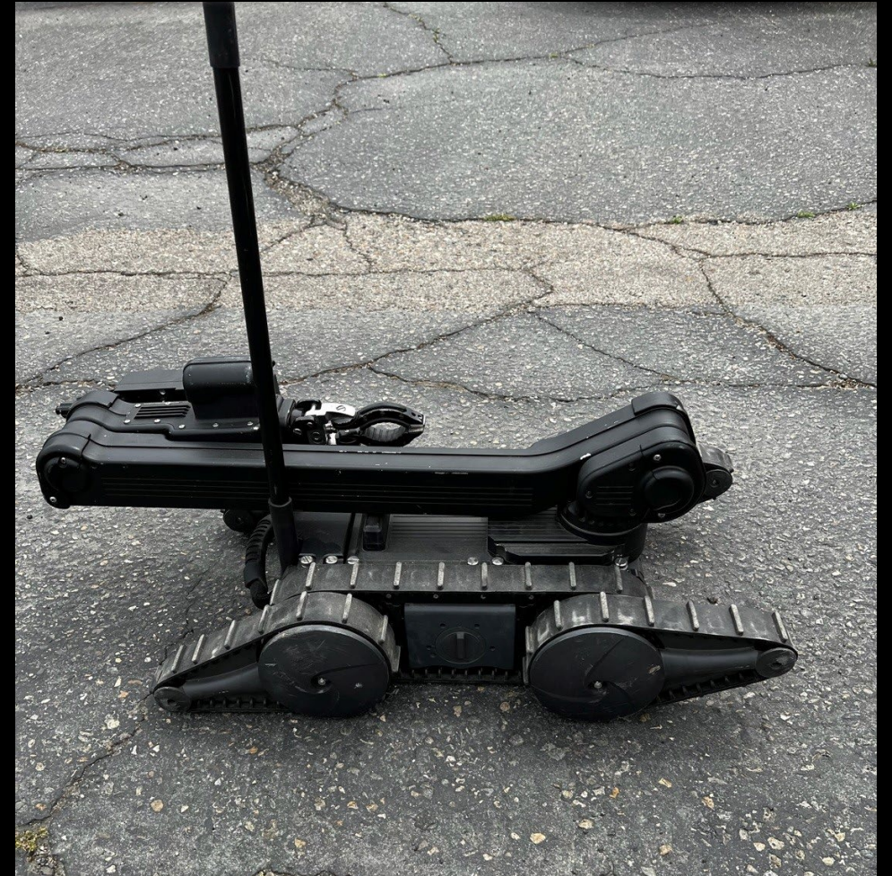
ROBOTEX Avatar III

Reference : Fresno Police Department Military Equipment Inventory, April 12, 2022, Page 1