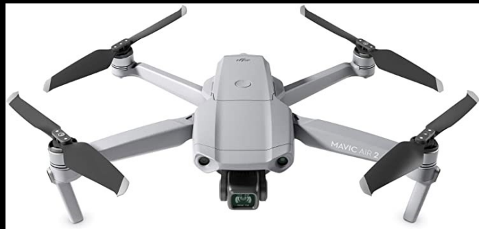
DJI MAVIC AIR