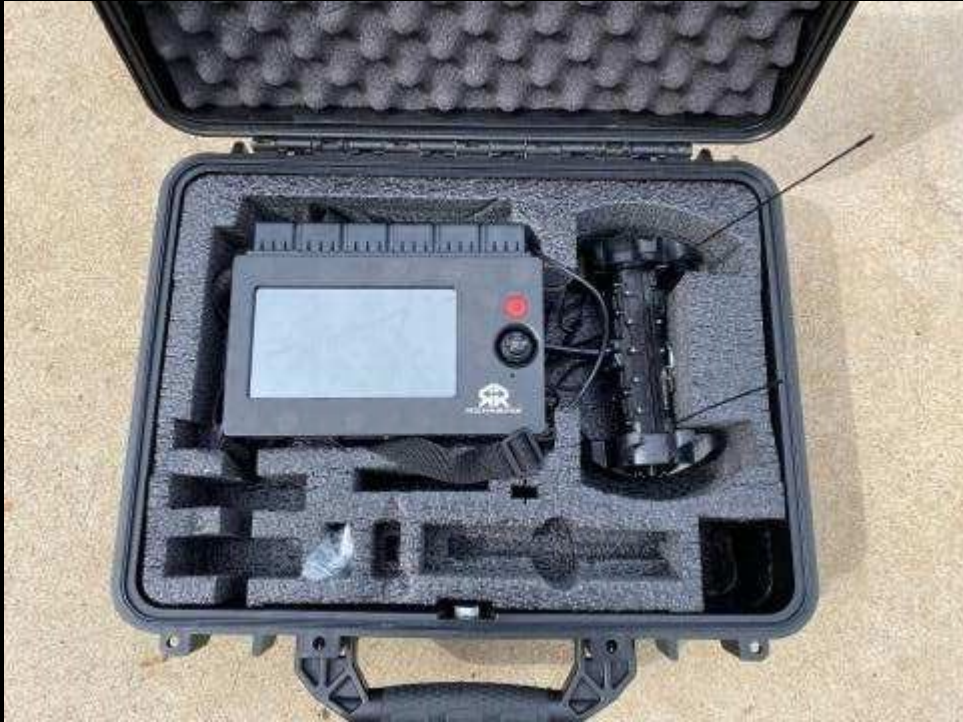
ROBOTEX Scout & Throwbot 2