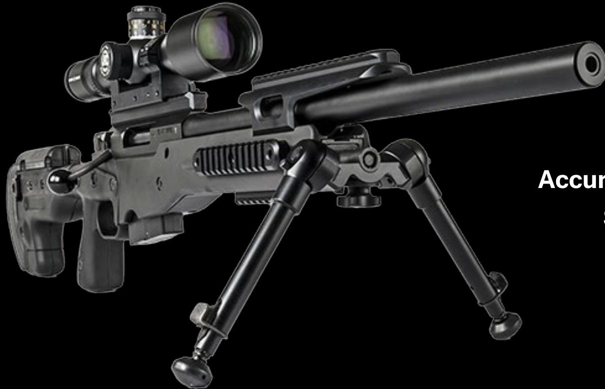
Accuracy International Sniper Rifle