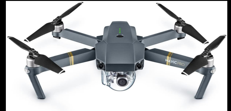
DJI MAVIC PRO