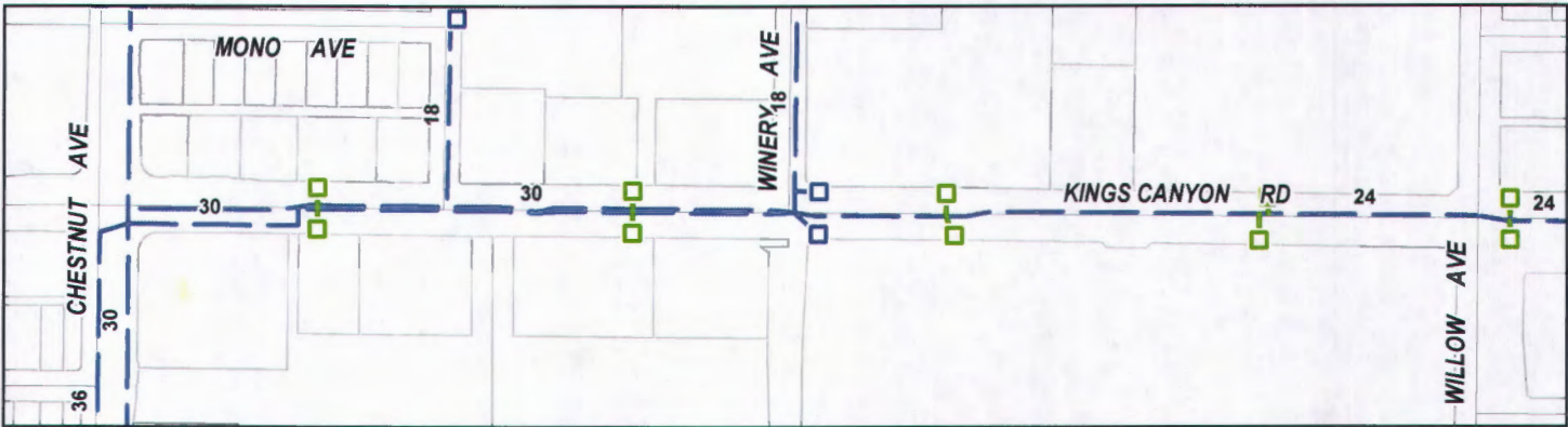
CHESTNUT AVE. TO WILLOW AVE.

NOTE: THIS MAP IS SCHEMATIC DISTANCES ARE APPROXIMATE.