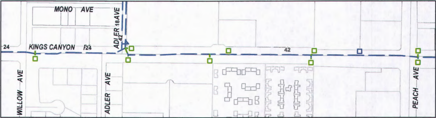
WILLOW AVE. TO PEACH AVE.