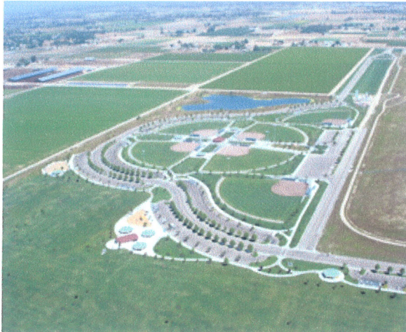
Fresno Regional Sports Complex Park

GMC will promote and create an earned media campaign for the public launch of the updating process with fun events that would include an interactive family-oriented community engagement Outdoor Gear Exchange & Food Truck Event to be held at the Fresno Regional Sports Complex Park. This event will allow GMC and its broad coalition of support the opportunity to register and encourage participation in the updating process for the initiatives. GMC will contact local English and Spanish TV news stations to not only obtain coverage of this event but also conduct pre and post event interviews in order to generate as much media attention as possible. GMC will also heavily market and promote the event online through the use of social media (Facebook pages, Twitter, Instagram, YouTube) using posts, graphics and short videos to engage the audience.