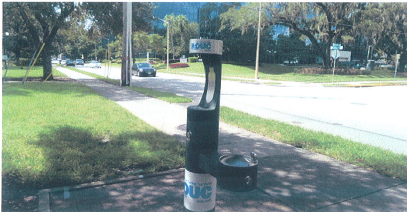
Hydration Station at Park with Brand Identity & Message

http://www.cityoforlando.net/ mayor/2015/09/new- hydration-stations-promote- reusable-water-bottles/