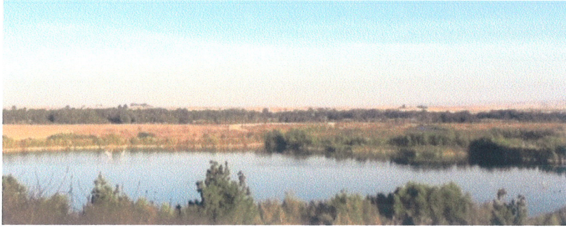
Lewis Eaton Trail