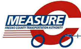
EXHIBIT A2 – PROJECT SCOPE