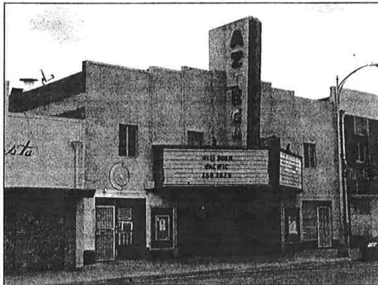
Photograph 1: 836-840 F Street; facing east, April 20, 2010 (P055).