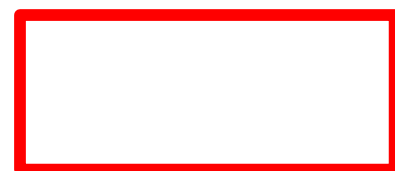
Proposed Annexation Area