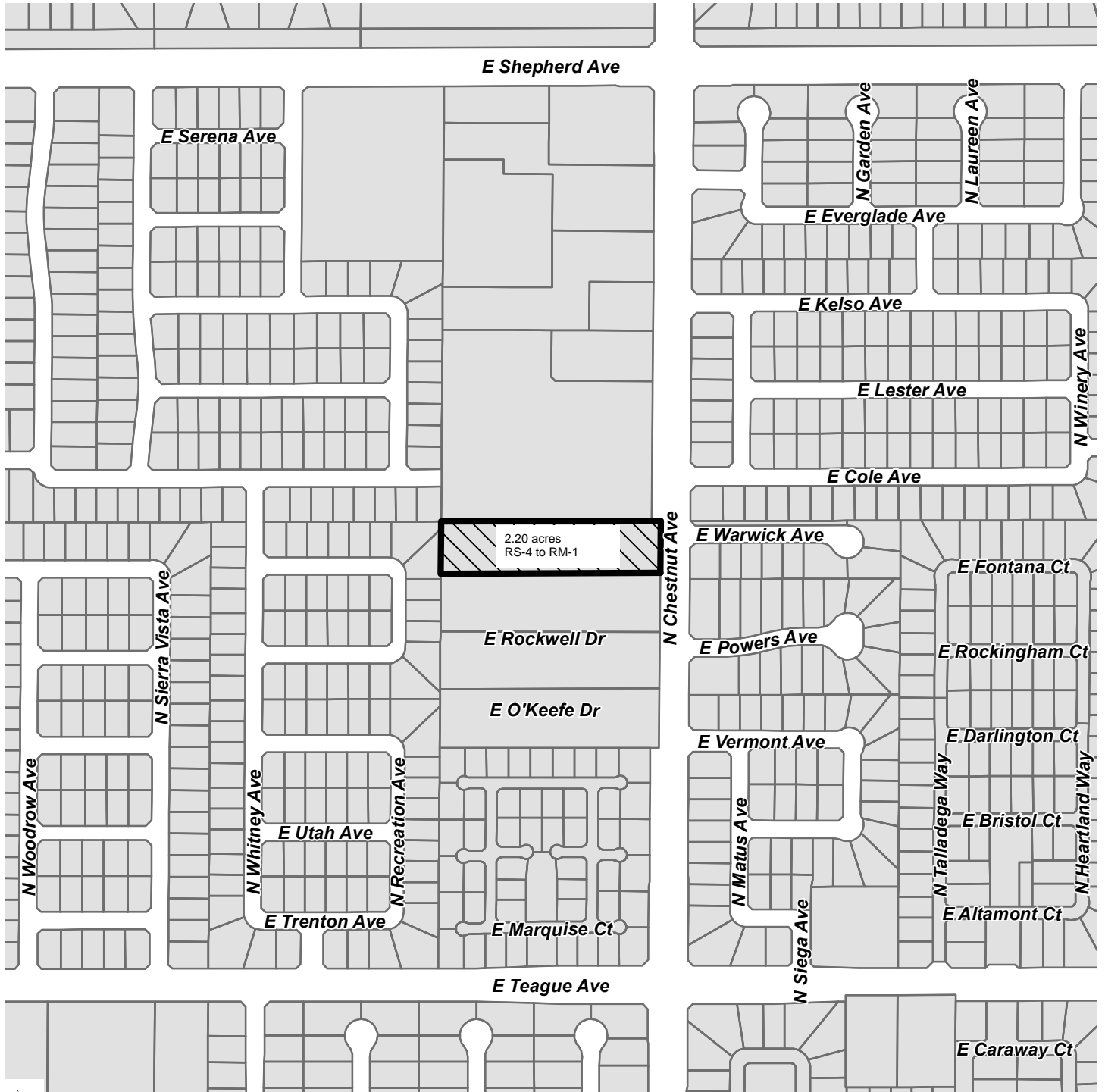
Exhibit A - Rezone Map