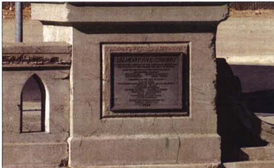
Figure 2. Plaque mounted at northeast end of the subway, view north.