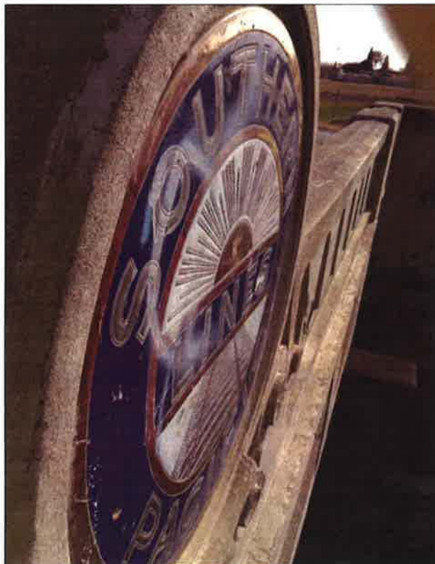
Figure 1. Southern Pacific Emblem (possibly metal on concrete), view east.

Also at the subject property is a plaque commemorating the construction of the subway attached to the end post of the northeastern railing facing Belmont Avenue (Figure 2). It appears that a similar plaque once existed on the post at the end of the southwestern railing, but that plaque has since been removed.