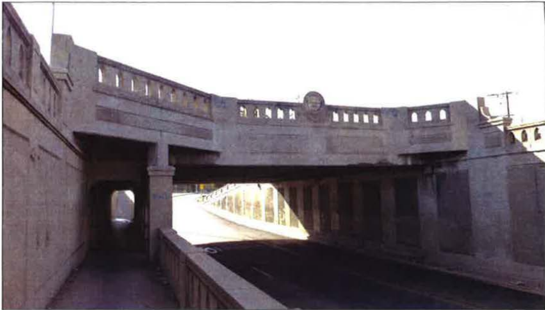
Figure 3. Pierced lancet architectural element on the Belmont Avenue Subway railings, view west.