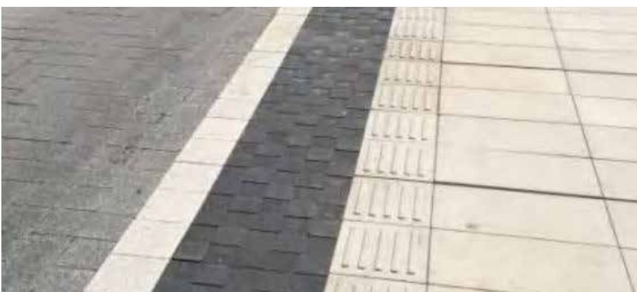
12' sidewalk with architectural scoring pattern