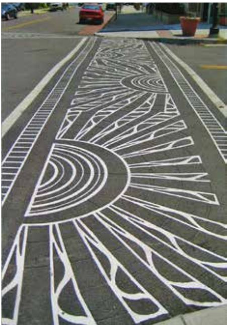
thermoplastic crosswalk with custom pattern