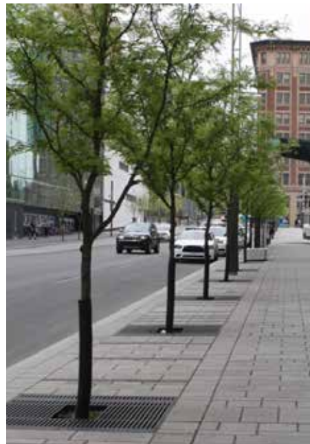
street trees with grates 30-50' spacing