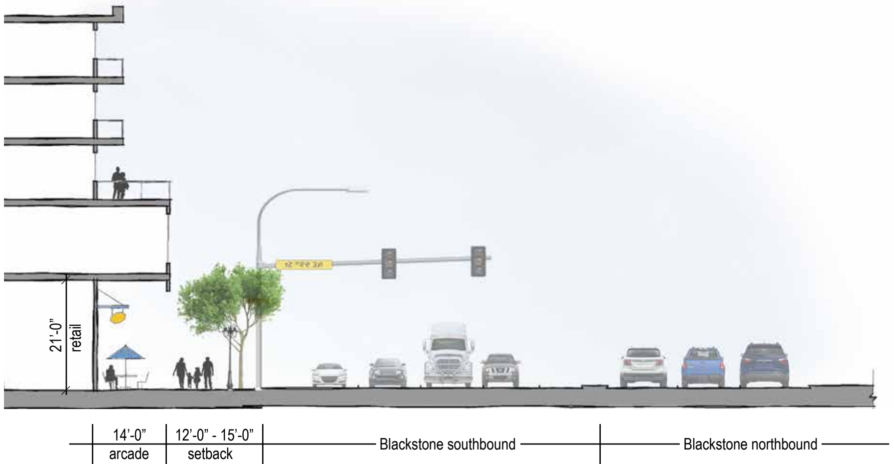
typical street section through Blackstone - opt 1