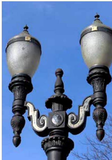
pedestrian scaled street lighting