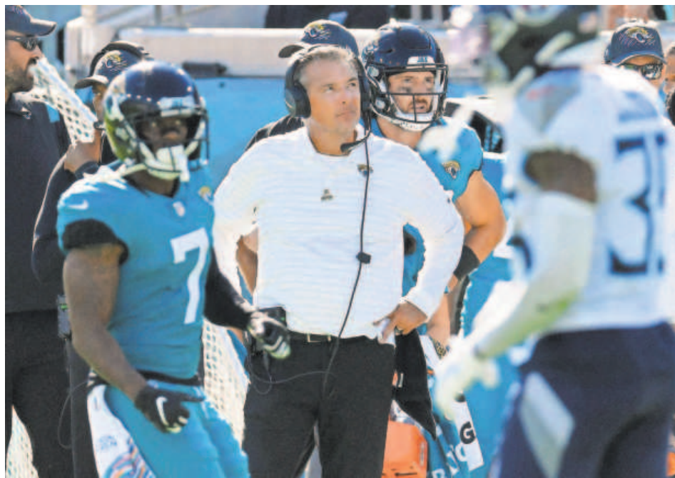
First-year NFL head coach Urban Meyer's Jaguars fell to 0-5 on Sunday and Jacksonville has lost 20 consecutive games.

Arizona was excellent in high-leverage situations. The Cardinals limited the 49ers to 3 of 11 conversions on third downs, kept the Niners out of the end zone in their only goal-to-go scenario of the game and stopped San Francisco on fourth downs on four out of five tries. According to Elias Sports Bureau, it was the only time in at least the last 40 seasons that a team recorded four fourth-