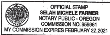
Notary Public-State of Oregon

SOURCEWELL HEAVY CONSTRUCTION EQUIPMENT WITH RELATED ACCESSORIES, ATTACHMENTS, AND SUPPLIES Proposals Due 4:30 pm, March 21, 2019 REQUEST FOR PROPOSALS: