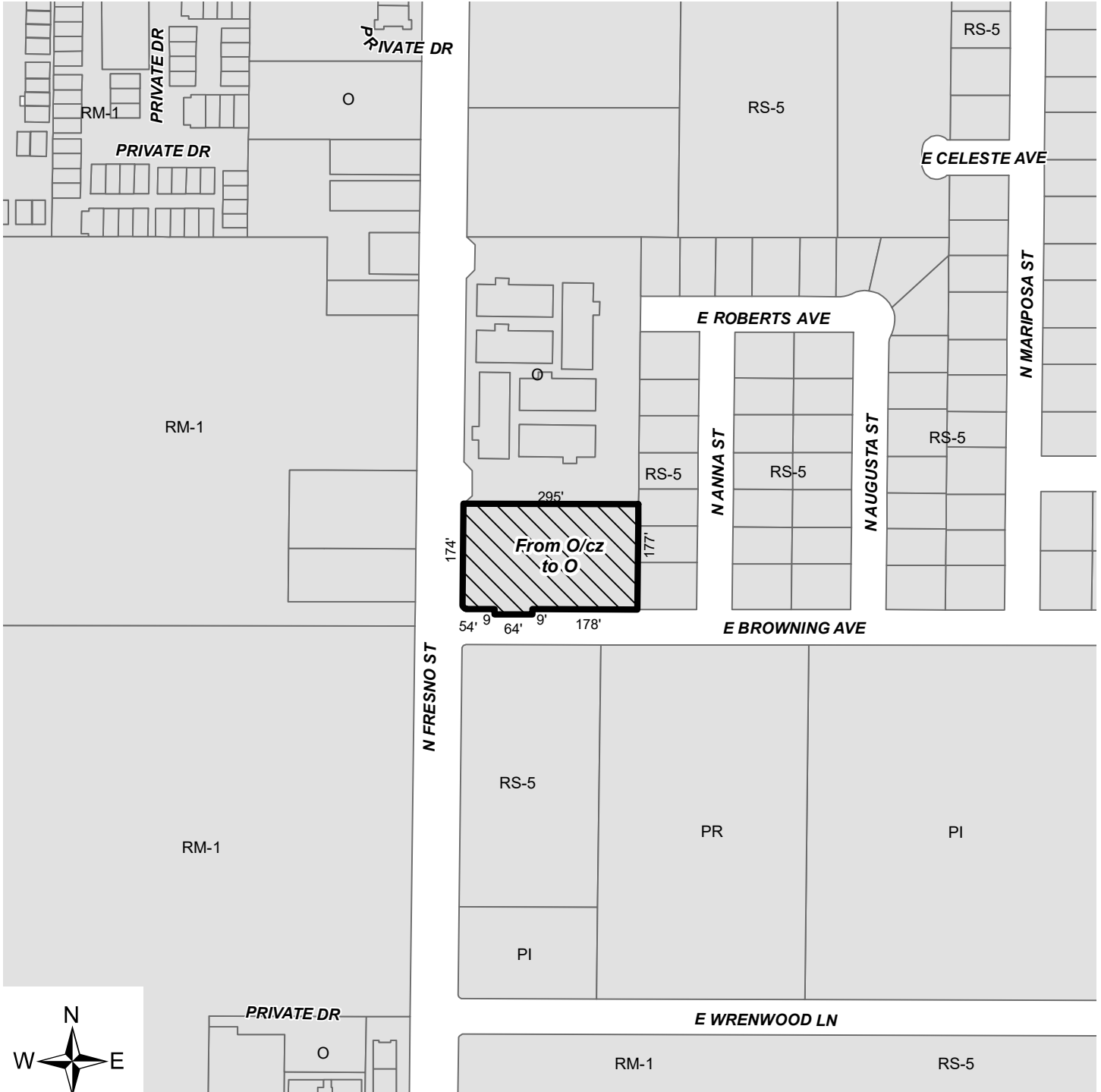
Exhibit A-Proposed Rezone

This map is believed to be an accurate representation of the City of Fresno GIS data, however we make no warranties either expressed or implied for correctness of this data.