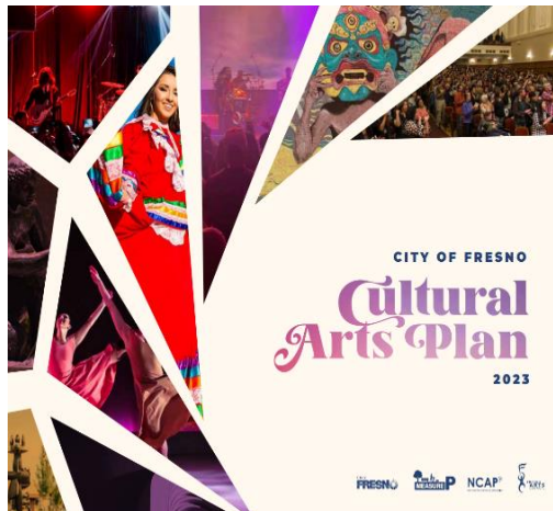
Figure 1 - A photo of the Cultural Arts Plan

Measure P (Sec. 7-1506(b)(4)(C)) requires that prior to the implementation of the Expanded Access to Arts and Culture Grant Program, the Commission shall work in partnership with the Fresno Arts Council, and local arts and cultural stakeholders, to develop a Cultural Arts Plan for the City of Fresno that identifies needs in the arts and cultural community; prioritizes outcomes and investments; and develops a vision and goals for the future of Fresno arts and cultural programs that are reflective of the cultural, demographic, and geographic diversity of Fresno. The Cultural Arts Plan must be updated every five years.