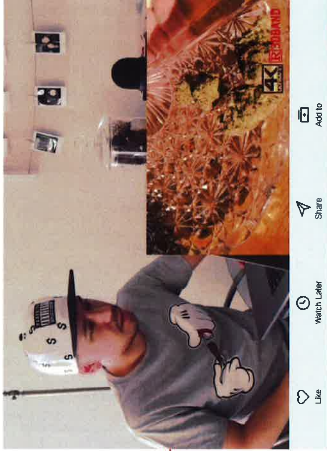
THAT'S CRINGE: Vape Hotbox with Noel Miller 4 months ago | 1.1K views