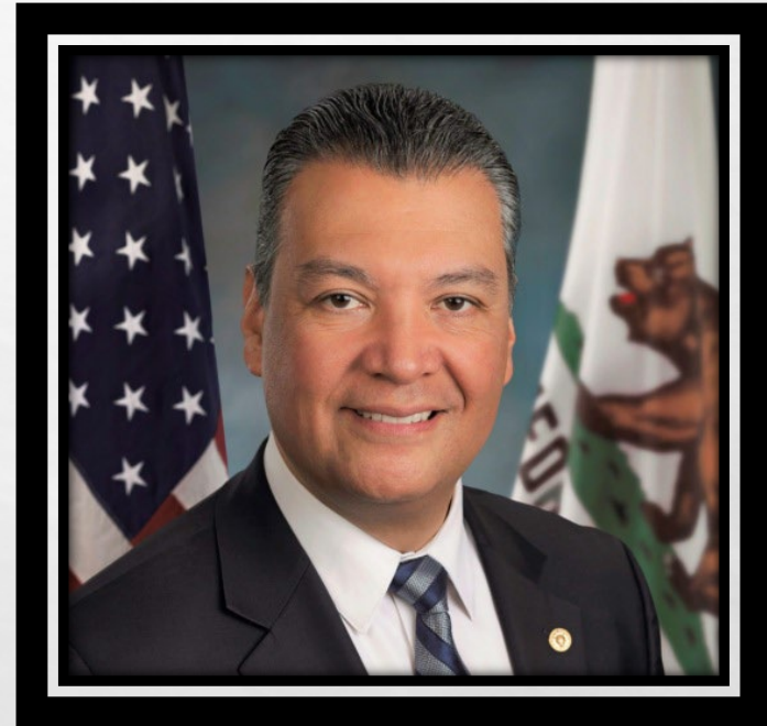
Alex Padilla, U.S. Senator, D-CA