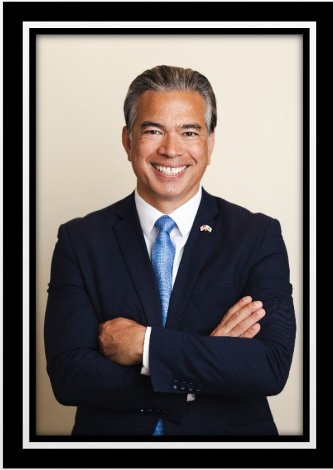
Rob Bonta, State of California, Attorney General