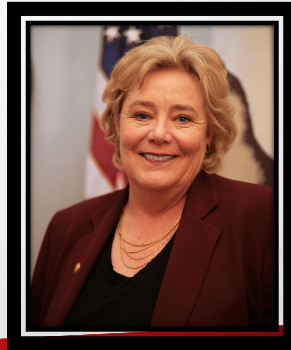
Congresswoman Zoe Lofgren CA-18 th Congressional District