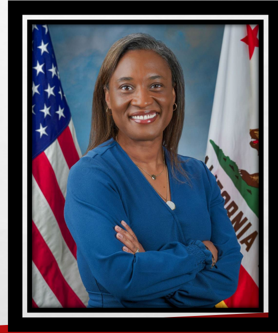
Laphonza Butler, U.S. Senator, D-CA