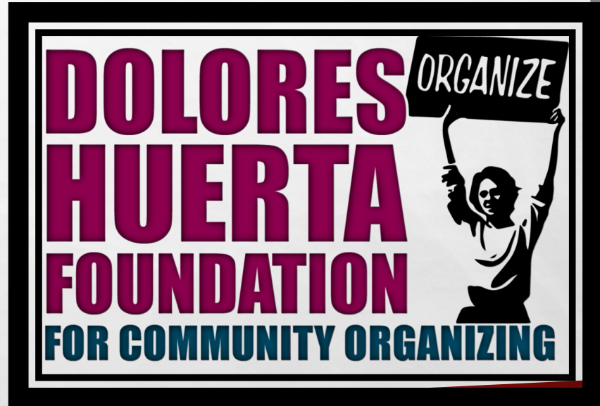
Dolores Huerta Foundation