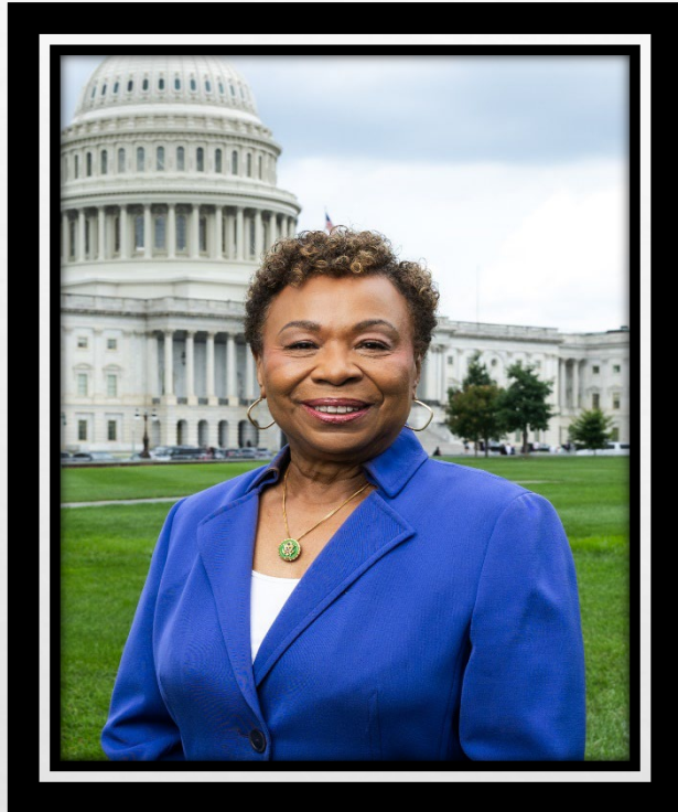
Congresswoman Barbara Lee CA-12 th ★ Congressional District