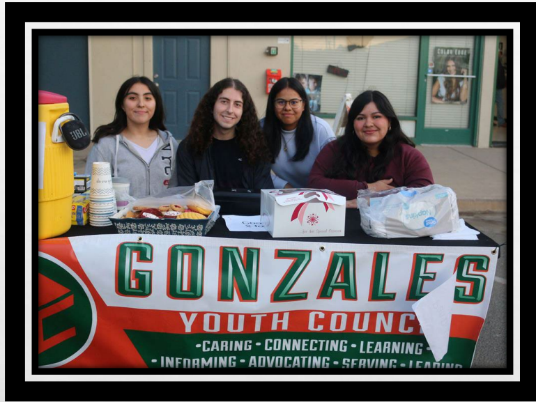
Gonzales Youth Council