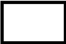
Subject Property (±1.07 acres)