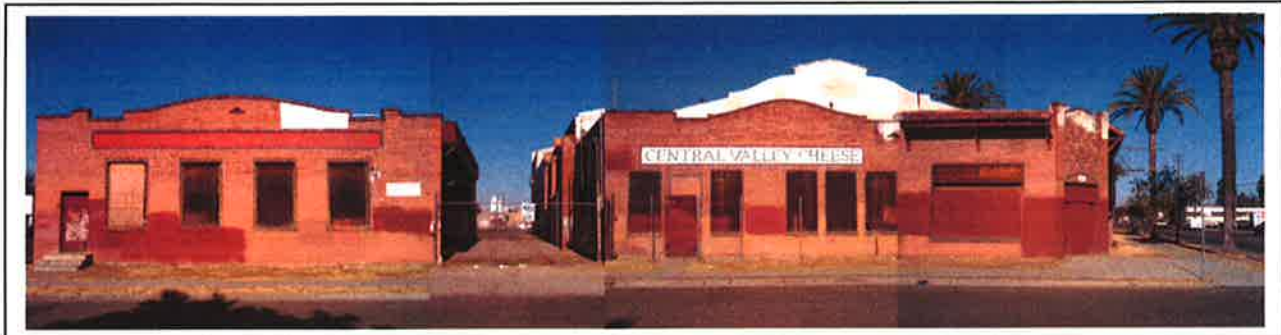
Photo above, Roosevelt Streetscape composite, courtesy of Kiel Schmidt.