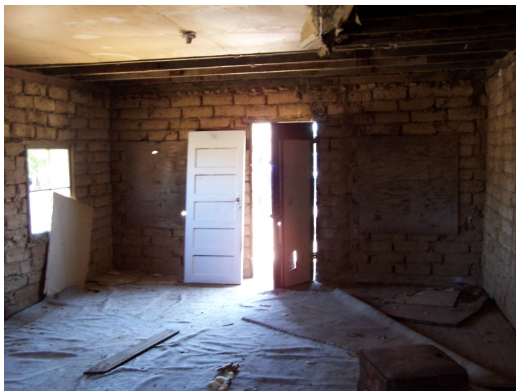
Interior of Main Living Space