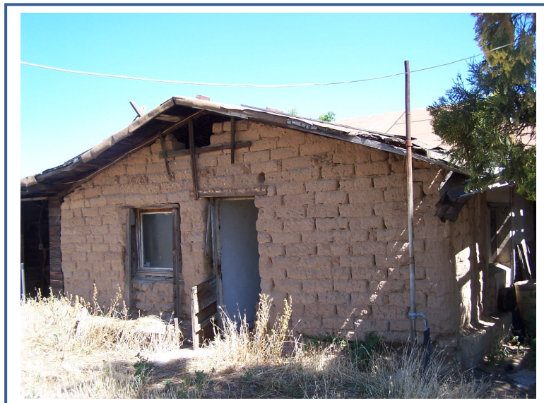
South Elevation with Traditional Adobe Brick