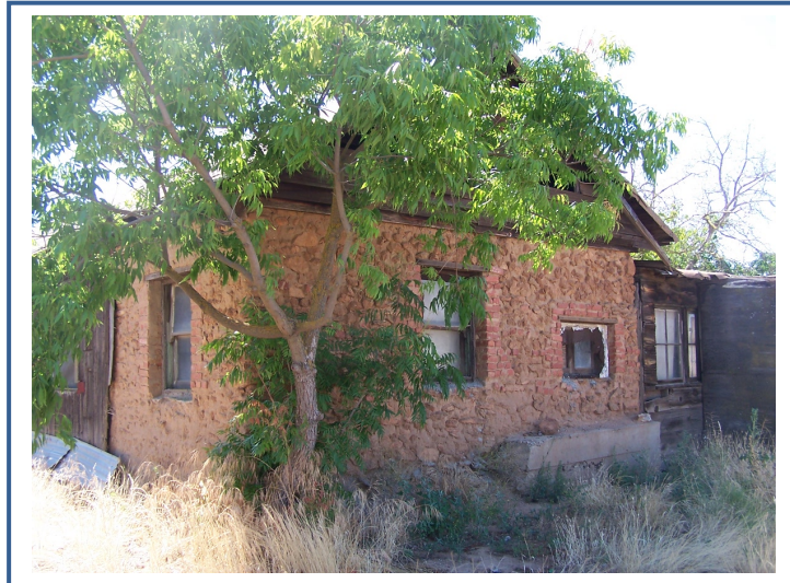
West Elevation Showing Hardpan Addition (Above)