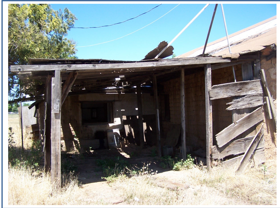
“Carport” on South End of Façade