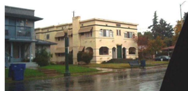
The parking lot for this apartment house is behind the main structure, accessed by a driveway along the side of the building. This is the preferred placement for Multiple family parking.