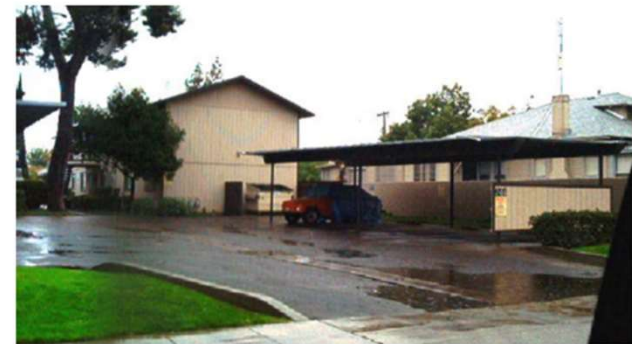
The parking lot for this apartment complex is in front of the main structure. This arrangement is never appropriate.