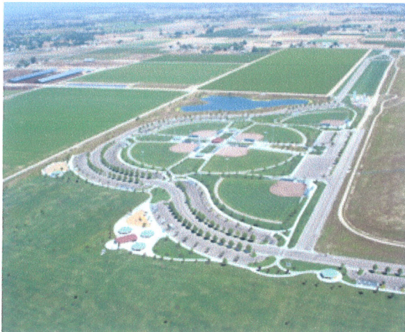
Fresno Regional Sports Complex Park

GMC will promote and create an earned media campaign for the public launch of the updating process with fun events that would include an interactive family-oriented community engagement Outdoor Gear Exchange & Food Truck Event to be held at the Fresno Regional Sports Complex Park. This event will allow GMC and its broad coalition of support the opportunity to register and encourage participation in the updating process for the initiatives. GMC will contact local English and Spanish TV news stations to not only obtain coverage of this event but also conduct pre and post event interviews in order to generate as much media attention as possible. GMC will also heavily market and promote the event online through the use of social media (Facebook pages, Twitter, Instagram, YouTube) using posts, graphics and short videos to engage the audience.