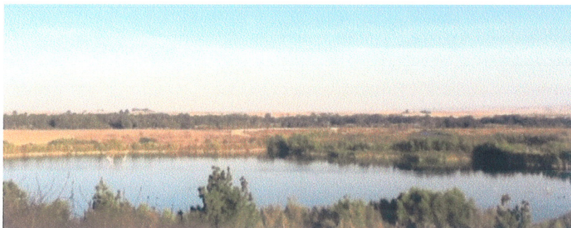
Lewis Eaton Trail