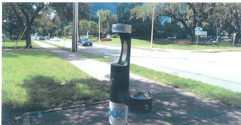
Hydration Station at Park with Brand Identity & Message

http://www.cityoforlando.net/ mayor/2015/09/new- hydration-stations-promote- reusable-water-bottles/