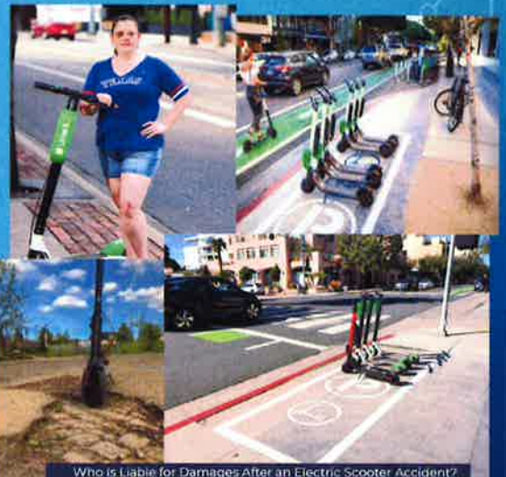
Who is Liable for Damages After an Electric Scooter Accident?

Who is liable for damages after an electric scooter accident? That's a question you might be asked. The answer is that it depends on the circumstances. If you were hit by a scooter while on the sidewalk, the scooter company may be liable.