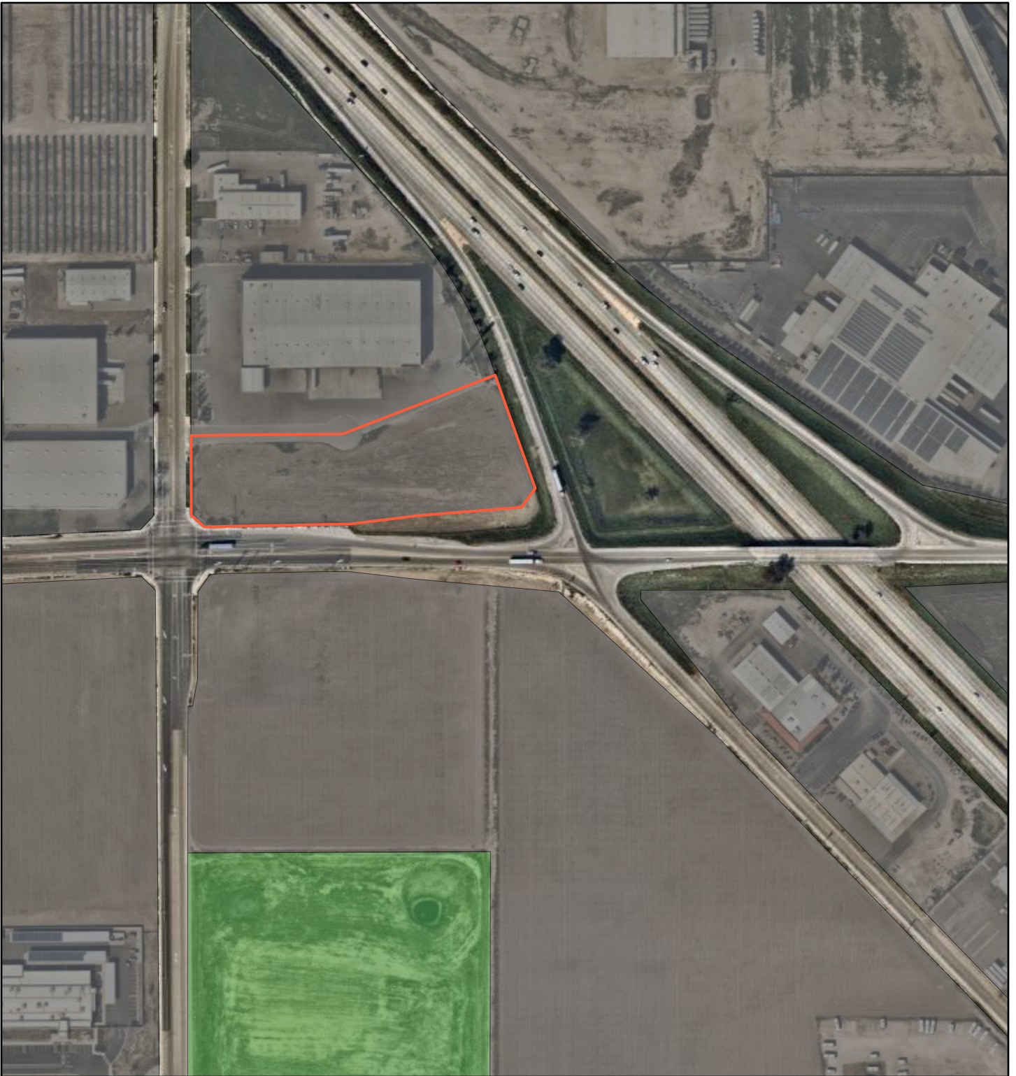
Exhibit B Planned Land Use and Zoning Map