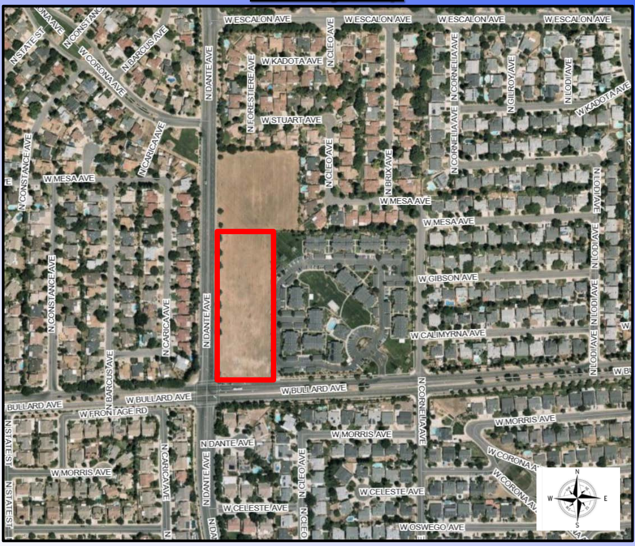
±3.73 acres of property located on the northeast corner of West Bullard and North Dante Avenues.