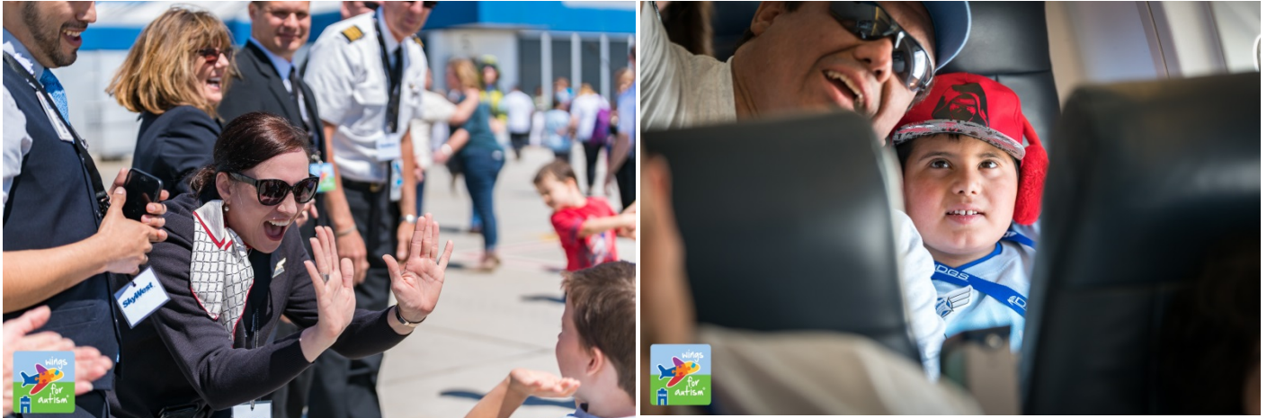
Picture 24: Wings for Autism brings enhanced training and partnerships between the airlines and community members.

with autism or other intellectual and developmental disabilities.