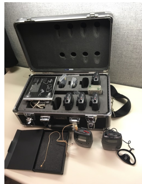
Picture 8: FM Systems are available for enhanced communication access.