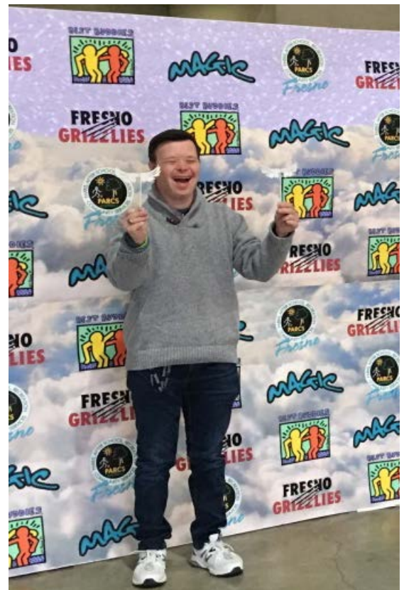
Picture 4: PARCS hosted multiple inclusive formal dances throughout the year.