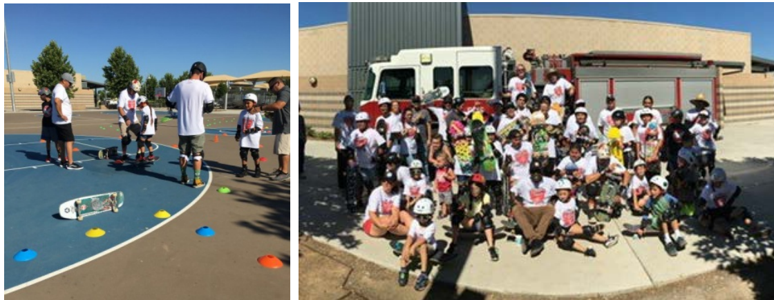
Picture 25: Inclusive Skate Camps help to promote healthy living and play for all.

The City of Fresno, Fresno Skate Salvage, and Magic Fresno collaborated to share their love for the world of skateboarding with the Inaugural No Limits Exceptional Needs Skate Jams.