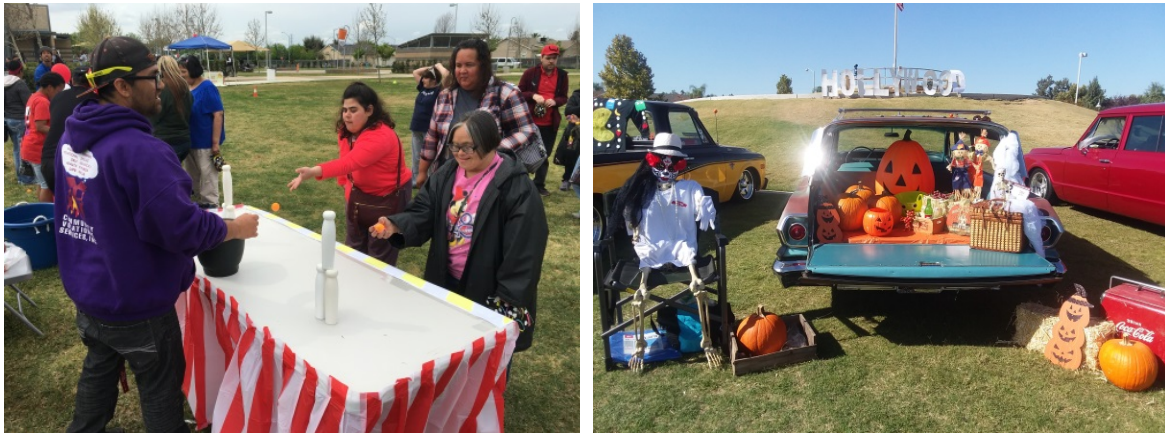
Picture 29: Carnivals and Trunk or Treat programs at Inspiration Park.

On October 30, 2018, PARCS hosted the inaugural Trunk or Treat event at Inspiration Park. This event was attended by over 250 participants in therapeutic programs, and featured carnival games, a puppet show, and candy giveaways. The carnival was so popular that another was planned for April 5, 2019, which also included a picnic lunch.