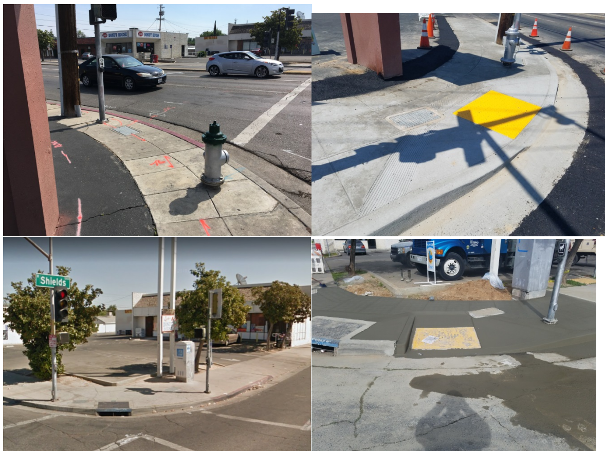
Picture 7: Shields and West Intersection posed many challenges for accessibility.