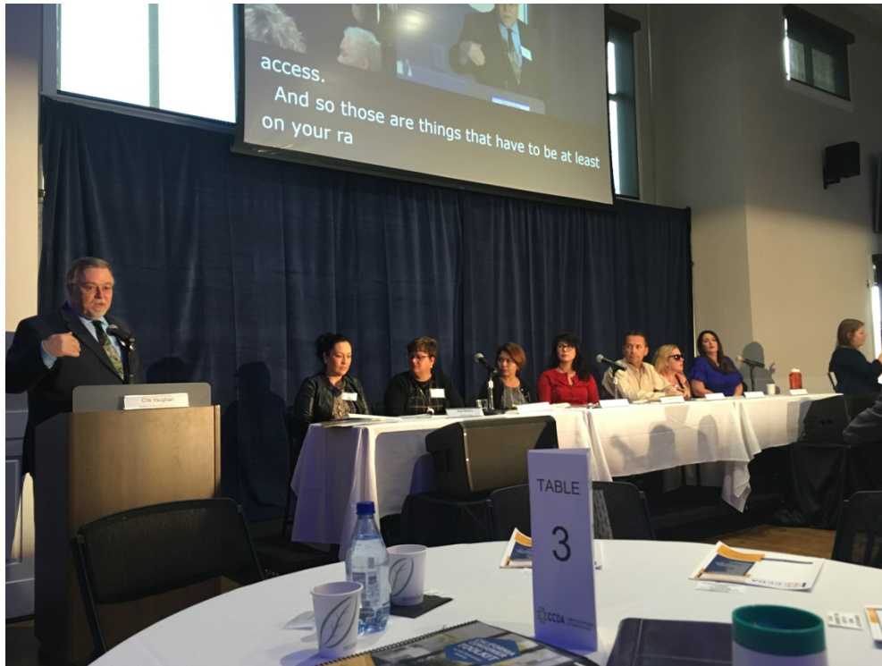
Picture 32: Fresno hosted CCDA for an expert panel on accessibility for the restaurant industry.

partnered to provide input to CCDA as they developed an accessibility Toolkit for the Restaurant Industry. On November 14, 2018 The City sponsored and participated in the CCDA Restaurant Industry Listening Forum.