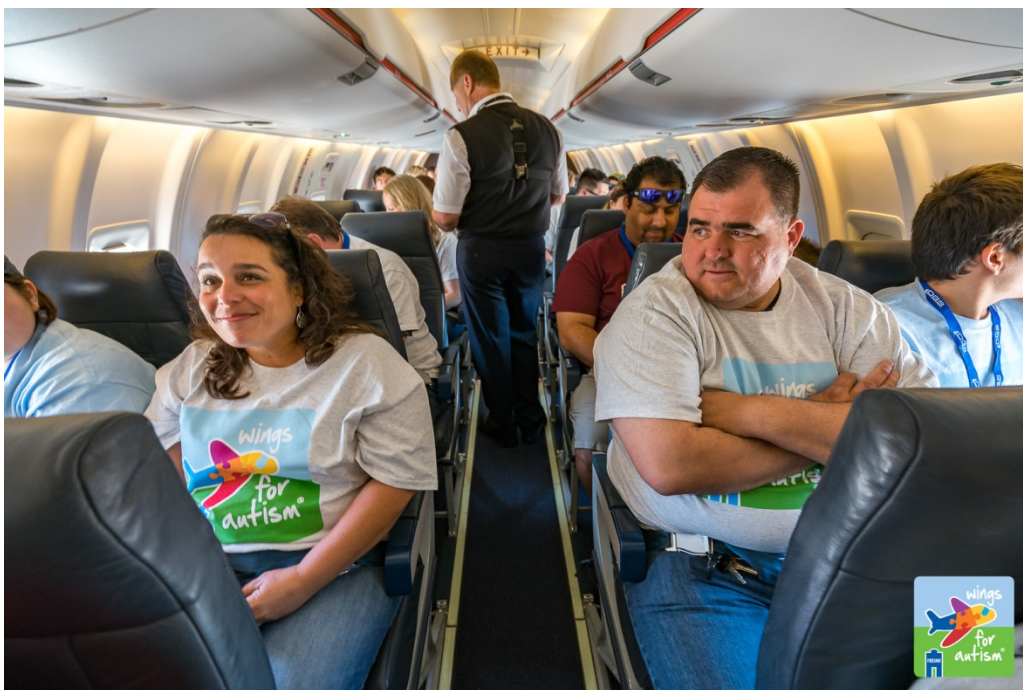
Picture 1: Wings for Autism, an annual event at Fresno Yosemite International Airport, provides air travel training for people on the autism spectrum.

Consistent with 28 C.F.R. §35.133(a), the City will maintain the accessibility of its programs, activities, services, facilities, and equipment, and will take whatever actions are necessary to do so, such as routine testing of accessibility equipment and routine accessibility audits of its programs and facilities. This does not prohibit isolated or temporary interruptions in service or access due to maintenance or repairs.