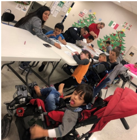
Picture 14: Holiday celebration at Beth Ramacher Developmental Center.

individuals with Intellectual or Developmental Disabilities (I/DD). The training is presented in part by representatives from National Alliance on Mental Illness, Fresno and Central Valley Regional Center. To date, FPD has trained a total of 352 personnel from the department and 105 officers from allied agencies in the 40 hour CIT course. The ultimate goal is to have every uniformed officer in Fresno PD trained in the full 40 hour course, and they are moving toward that target with four to six courses to be scheduled during 2020.