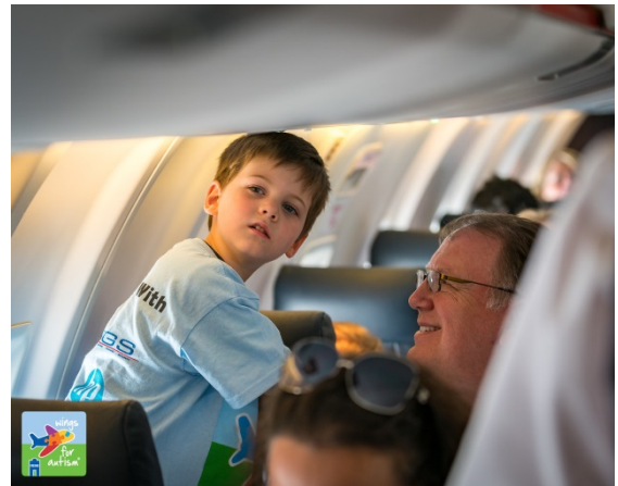
Picture 23: Knowing what to expect on an airplane helps to alleviate the stress of travel.

April 28, 2018 Fresno Yosemite International Airport hosted the second Wings for Autism® program sponsored by The Arc of the United States, in partnership with The Arc Fresno/Madera Counties, SkyWest Airlines,