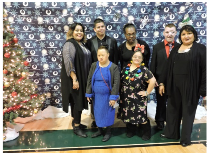
Picture 31: Formal dances give a fun opportunity to get dressed up and boogie the night away!