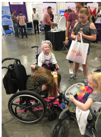
Picture 21: Abilities Expo workshops teach community members how to prepare for their unique needs and practice to "Lock, Cover, and Hold On."

workshop Emergency and Earthquake Preparedness for People with Disabilities with the Earthquake Country Alliance (ECA). ECA is a public-private partnership of people, organizations, and regional alliances that work together to improve preparedness, mitigation and resiliency, funded by the Federal Emergency Management Agency (FEMA). ECA coordinates the international Great ShakeOut event and provides information and resources to help everyone get prepared to survive and recover quickly.