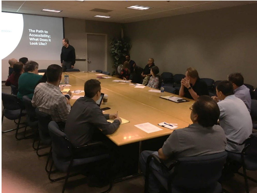
Picture 17: Public Works partnered with Resources for Independence Central Valley for a training about the experiences of people with disabilities.