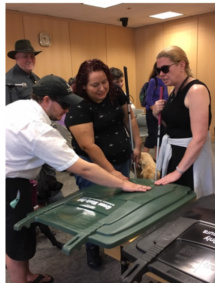
Picture 19: Solid Waste Division announced their new Braille and Raised Text waste bin lids at the DAC meeting.

Agendas, minutes, and supporting documents for DAC Activities are on file in the office of the ADA Coordinator as well as available online at https://fresno.legistar.com and www.fresno.gov/dac .