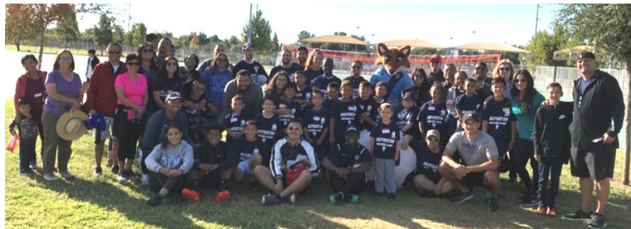
Picture 28: The Fresno Football Club and Zorro mascot join with eager participants at Inspiration Park.