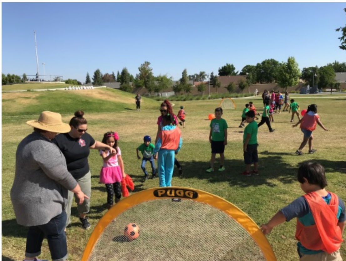
Picture 3: Soccer Camp was one of the many inclusive events held at Inspiration Park.