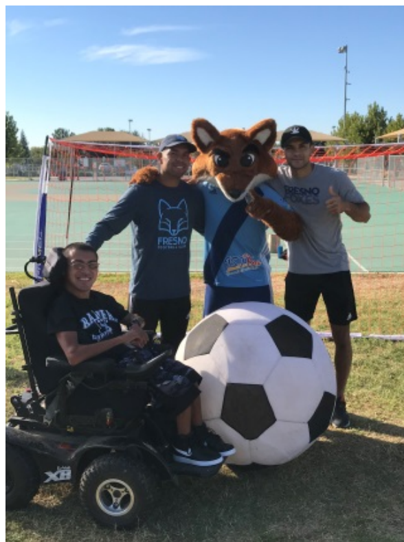
Picture 5: Fresno Football Club partnered with PARCS for an inclusive soccer camp.

Physical records of the City-wide self-evaluations, sidewalk access surveys, and the facilities survey