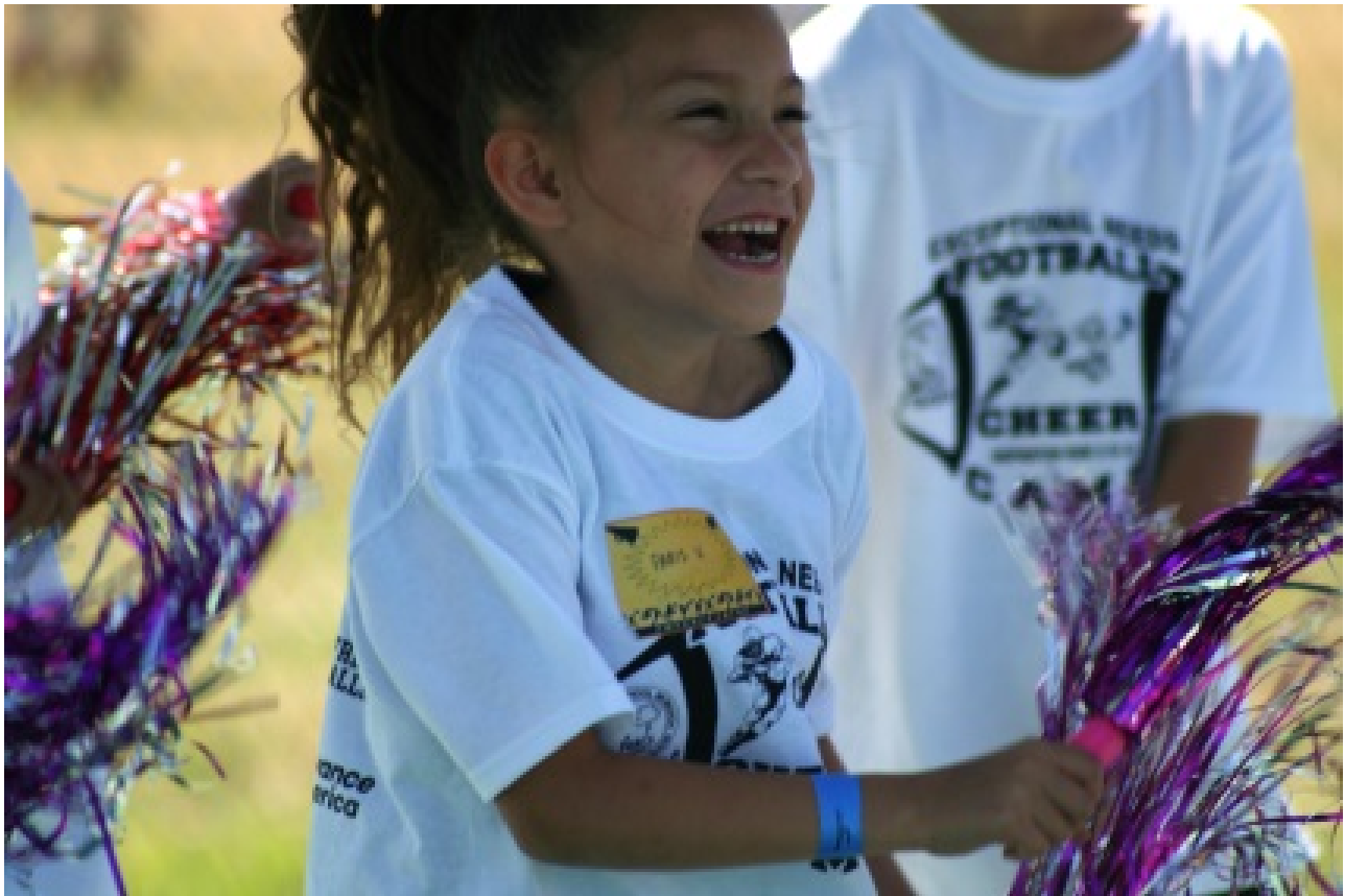
Picture 6: PARCS Exceptional Needs Football and Cheer Camp is a popular event.

course of this the assessment there were opportunities for people with disabilities to provide input on the plan. Records of the physical assessment, Transition Plan, and compliance related projects are maintained by the Department of Public Transportation/FAX.