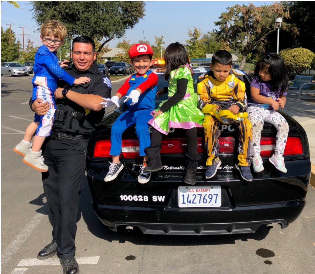
Picture 9: Officers attended a Halloween celebration at Beth Ramacher Developmental Center. The department makes efforts to build positive relationships within the community.

“T” or telephone coils can switch them on and receive signals directly to their hearing aid. Those without “T” coil equipped hearing aids can use a receiver. The City Clerk’s Office has a portable FM System which is not equipped with the individual loop system however it is compatible with individual loops that may be obtained from the office of the ADA Coordinator.