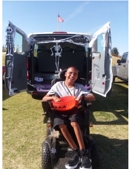
Picture 2: In October, PARCS hosted a “Trunk or Treat” event at Inspiration Park.