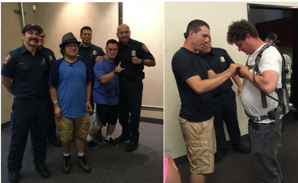
Picture 16: During a round table discussion VPCI participants and Fire Fighters had an opportunity to get to know each other better, including testing out fire equipment.

Center, and NorCal Services for Deaf and Hard of Hearing.