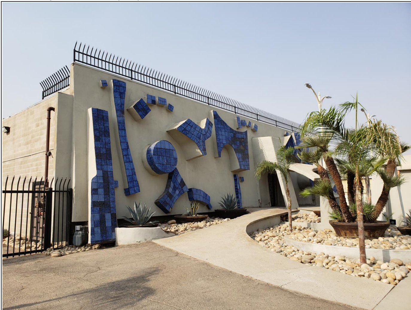
Looking northwest, 27 October 2019