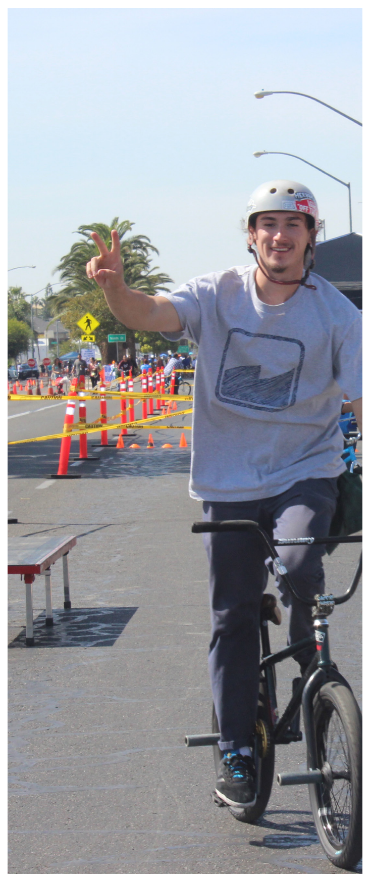
Bicyclist at CenCalVia on King Canyon