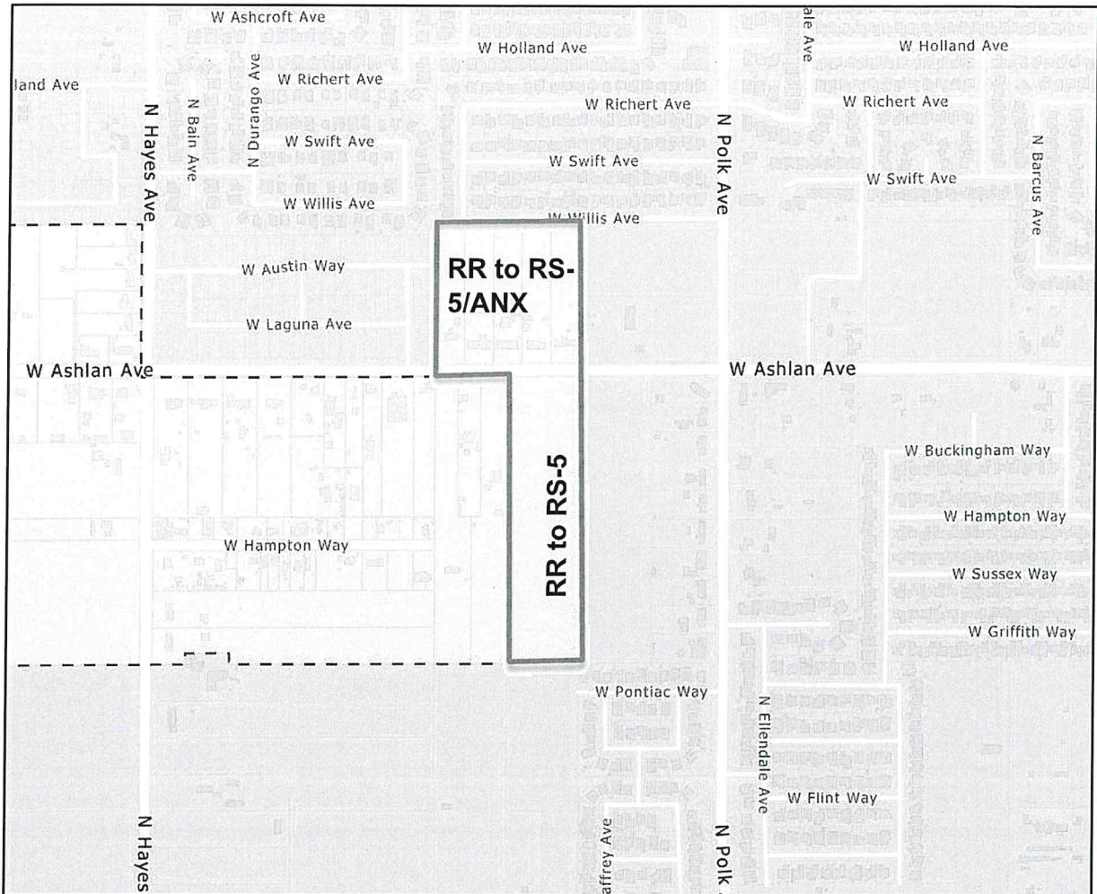
Exhibit A – Vicinity Map